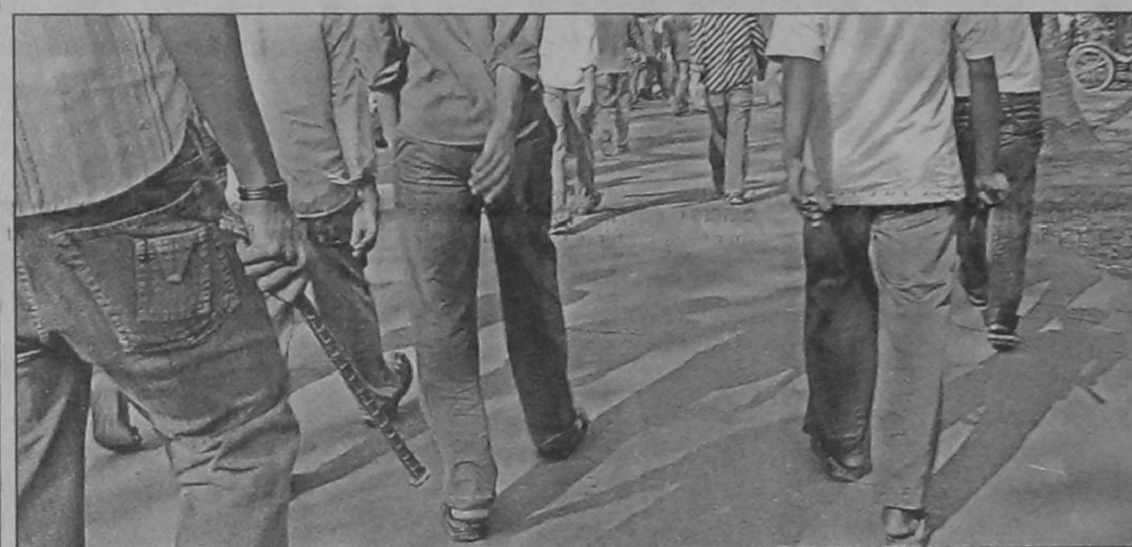
A group of students supporting strike chase others who are against the strike on the Dhaka University campus yesterday. Students demanding abolition of the quota system in the BCS examination called the strike but withdrew the strike later.