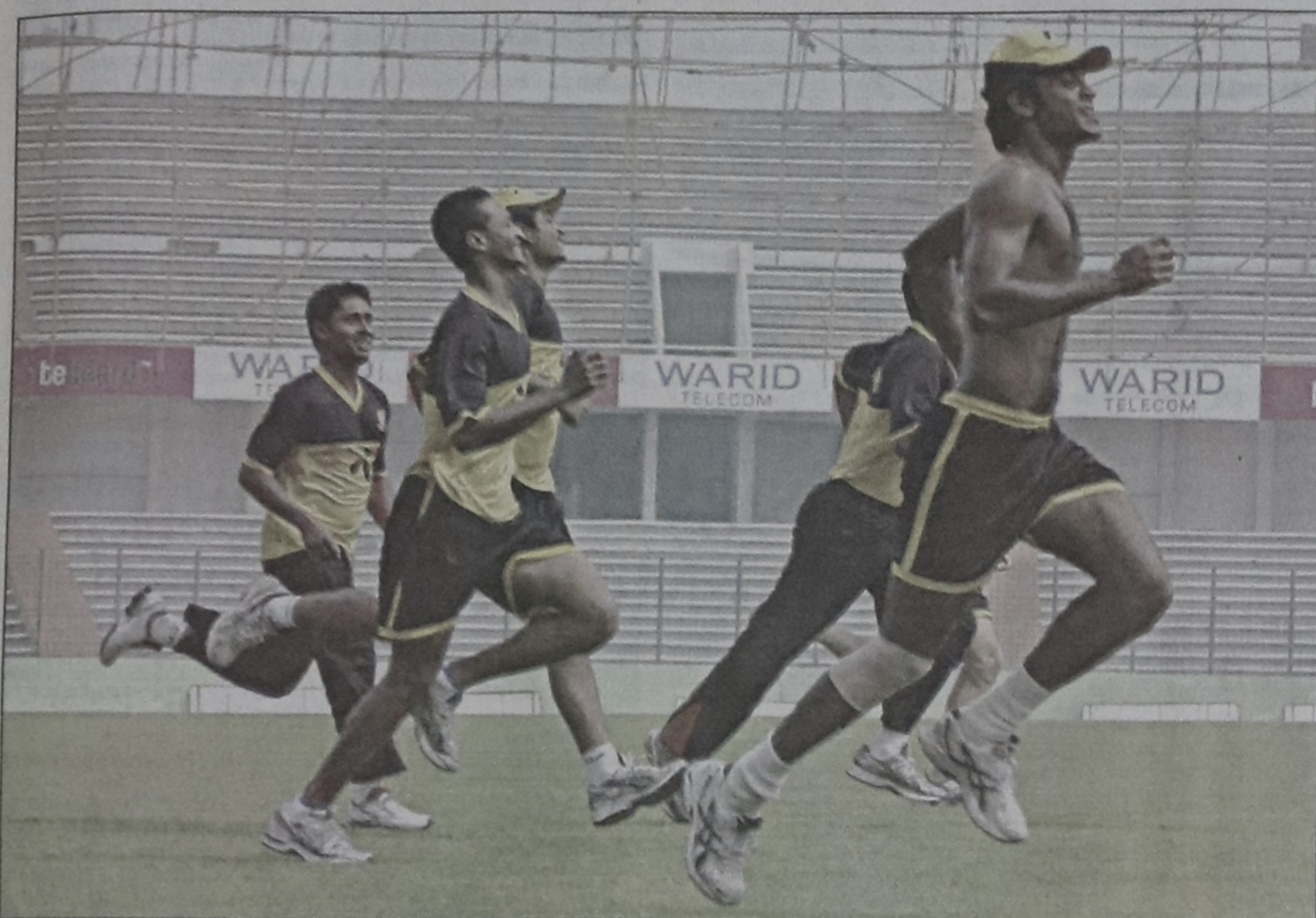
Bangladesh cricketers run on what could have been the fifth and final day of the first Test at the Sher-e-Bangla National Stadium in Mirpur yesterday. The Tigers lost the first Test against South Africa on the fourth morning on Monday.