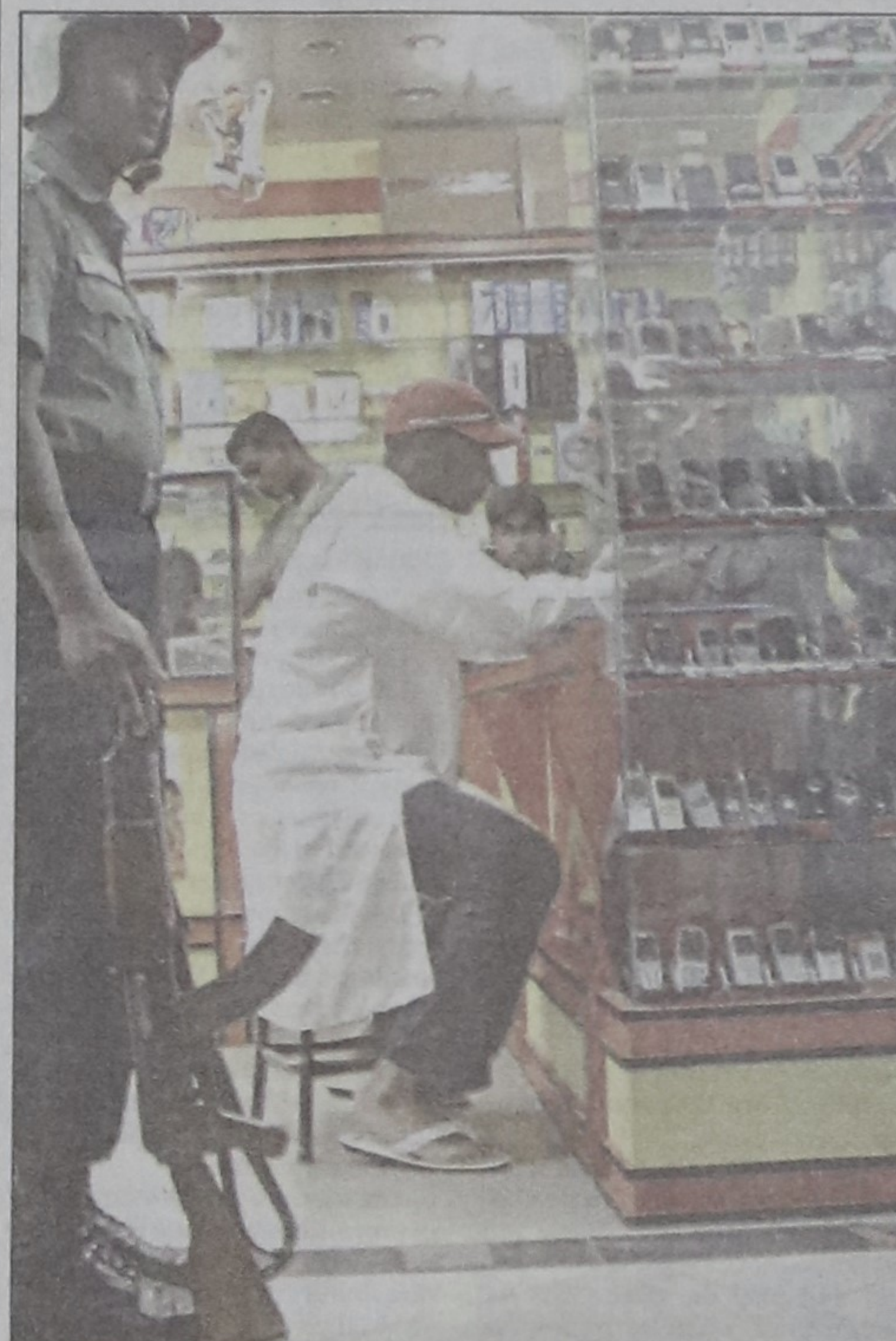
South Africa pace bowler Makhaya Ntini is busy searching for his desired mobile set at a city shopping mall yesterday.

The semifinals will be held at the Fatullah Cricket Stadium tomorrow.