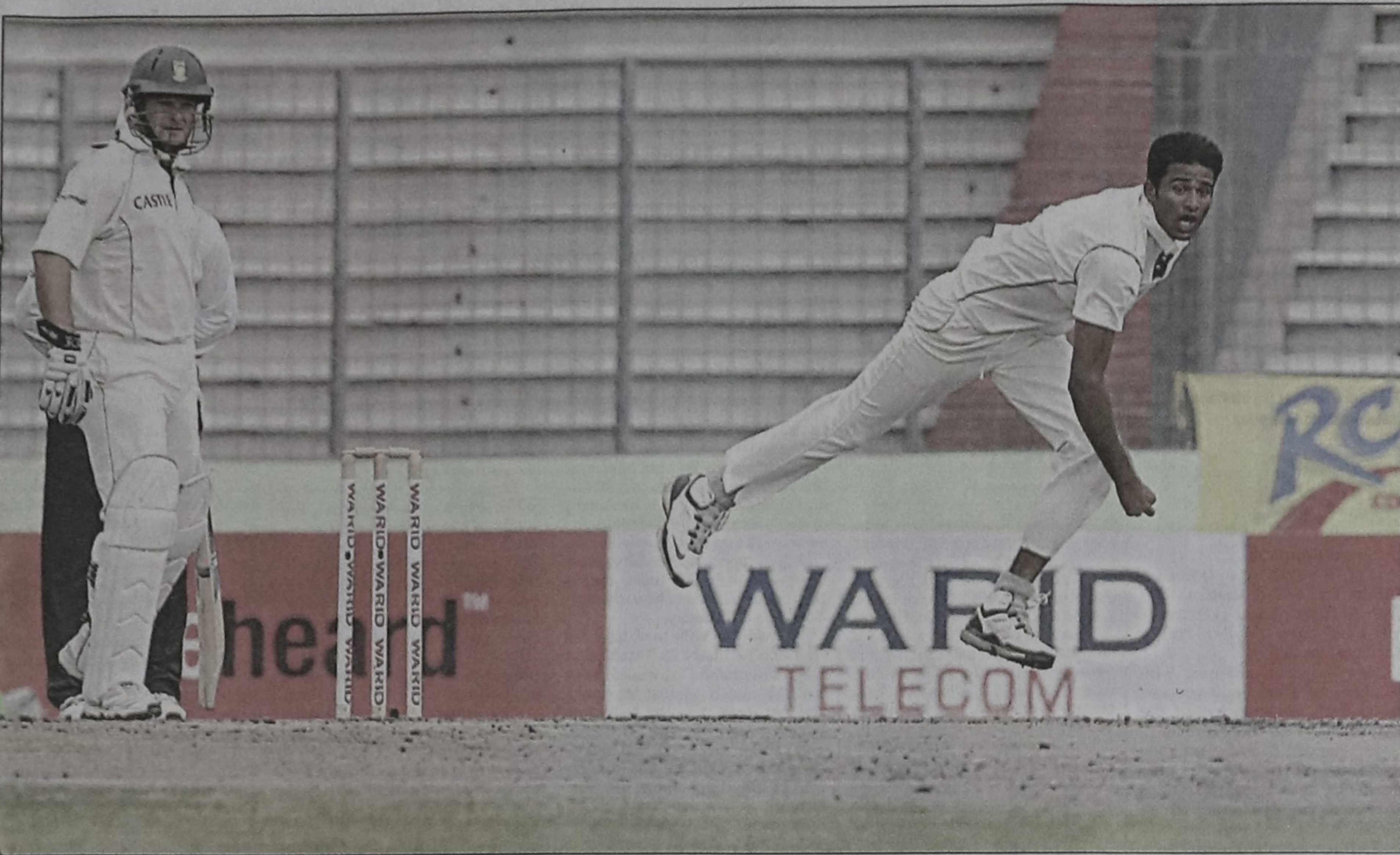
A WHOLE-HEARTED EFFORT: Bangladesh speedster Shahadat Hossain is on to his follow-through after a delivery during the South Africa second innings on Day Four of the first Test at the Sher-e-Bangla National Stadium in Mirpur yesterday.