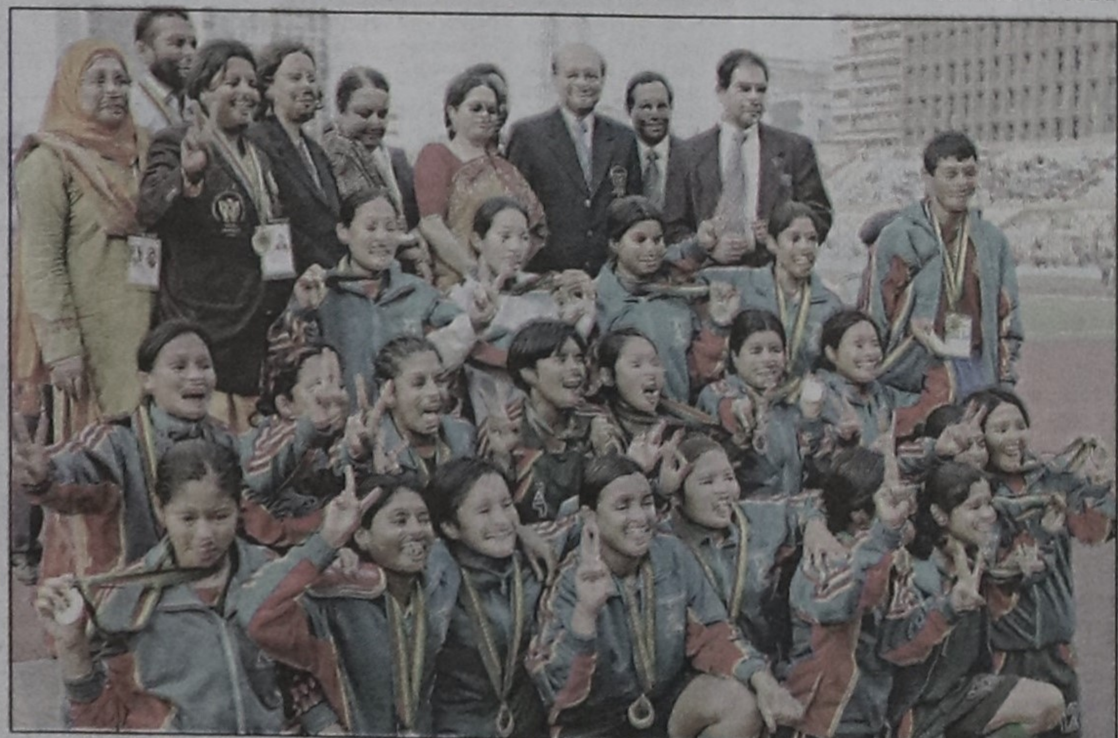
The Bangladesh eves celebrate after beating West Bengal for the football gold medal of the 2nd Indo-Bangladesh Bangla Games at the Bangabandhu National Stadium yesterday.