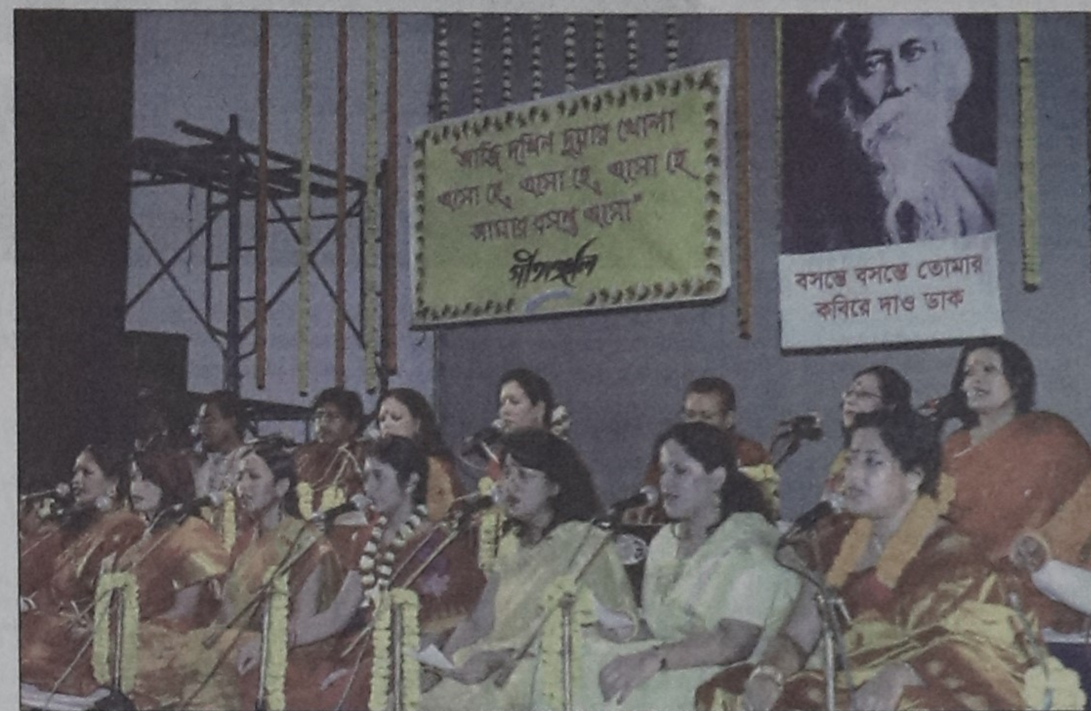
Artistes of Geetanjali sing at the programme