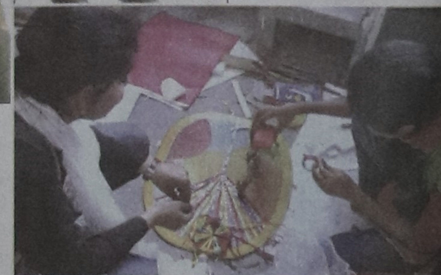
Students at the workshop