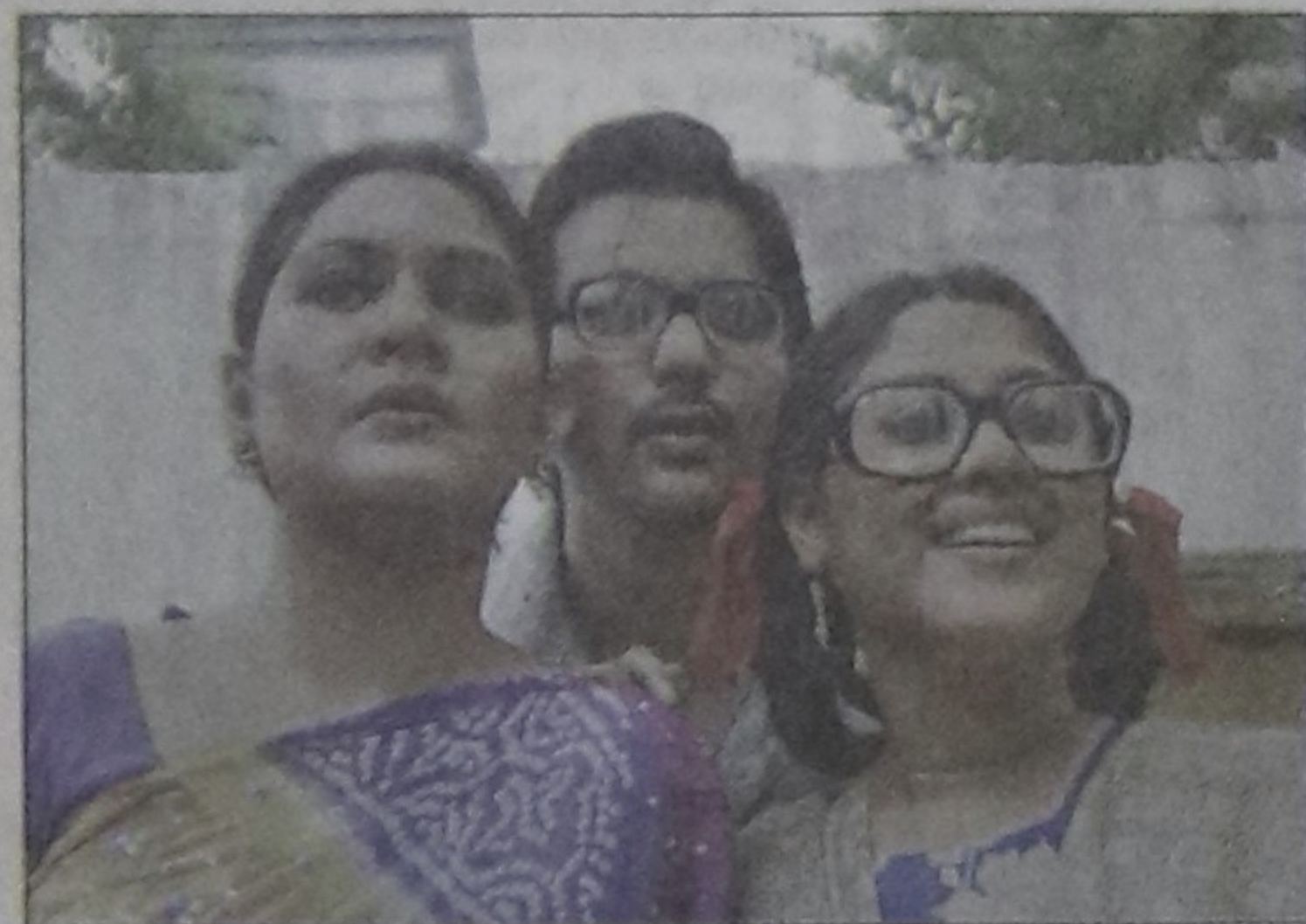
A scene from Mahanagar