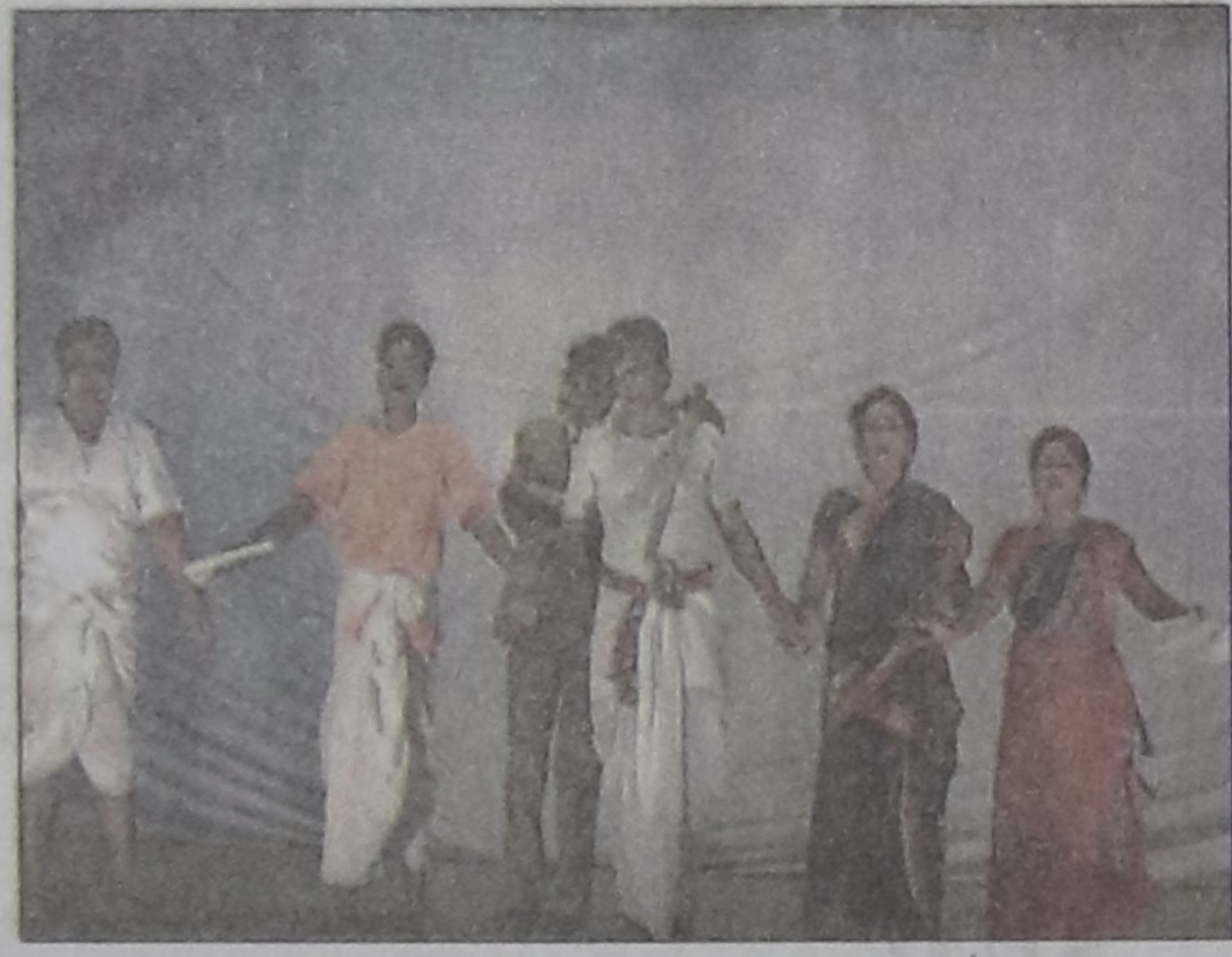
Actors in the play Ma-Mati-Manush

The plays staged at the festival included Bagdutta , Nawab Siraj-ud-Dowla , Ma-Mati-Manush , Nachmahal , Tajmahal , Mugal-E-Azam and Ekti Paisa .