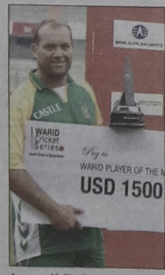
Jacques Kallis: Man-of-the-match