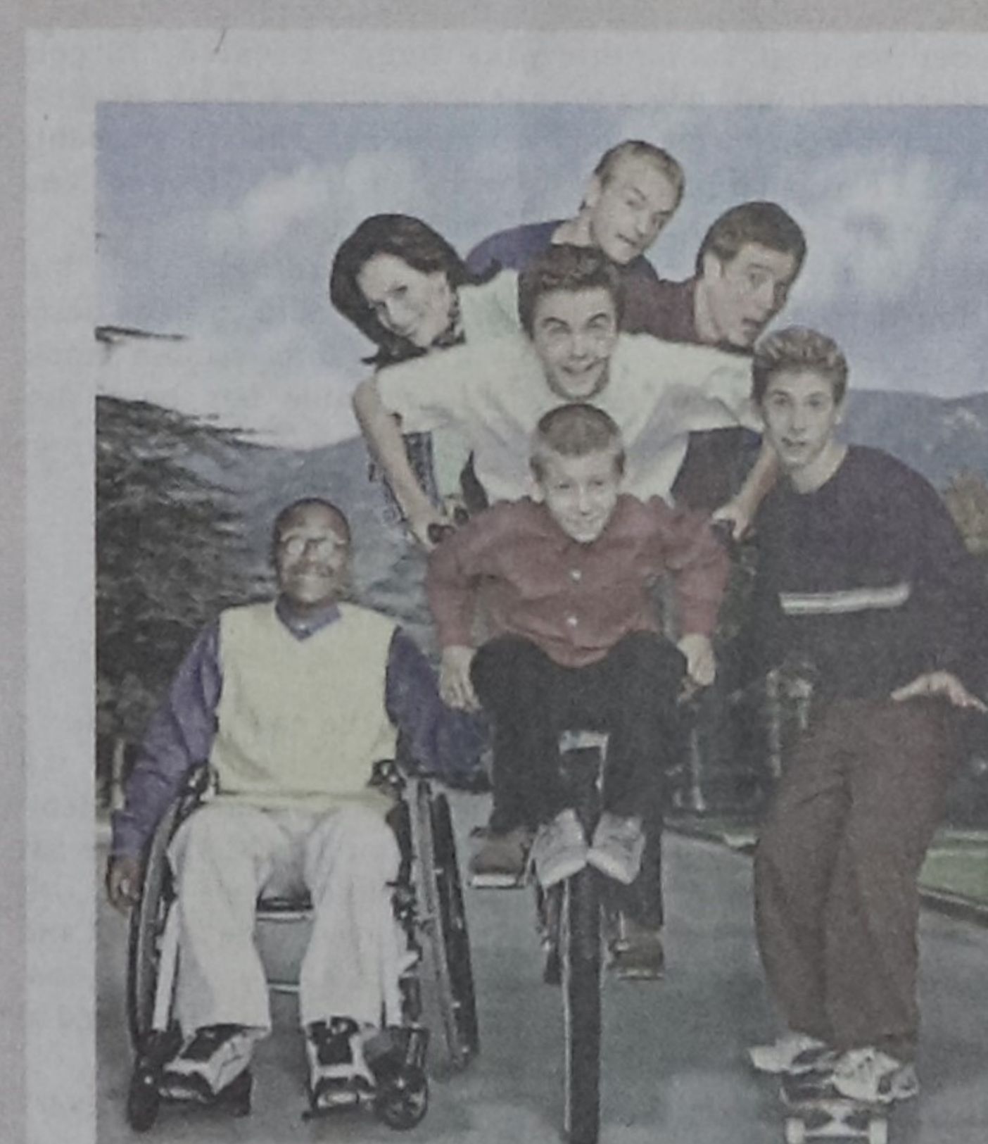
Malcolm in the Middle On Star World at 6:00 pm Cast: Frankie Muniz, Erik Per Sullivan

09:05 Borney Borney Rochito 09:35 Musical Programme: Path Chaoatei Anondo 10:00 Drama Serial: Poroshpor 11:00 Taroka Alap 11:30 Drama Serial: Aguntuk 12:15 Wide Angel 12:35 Musical Programme: Path Chaoatei Anondo 01:00 Gaanchil Ei Din 01:30 Dhallywood Beats 02:30 Bangla Feature Film 06:00 Protidin 06:35 Prachir Ghera China