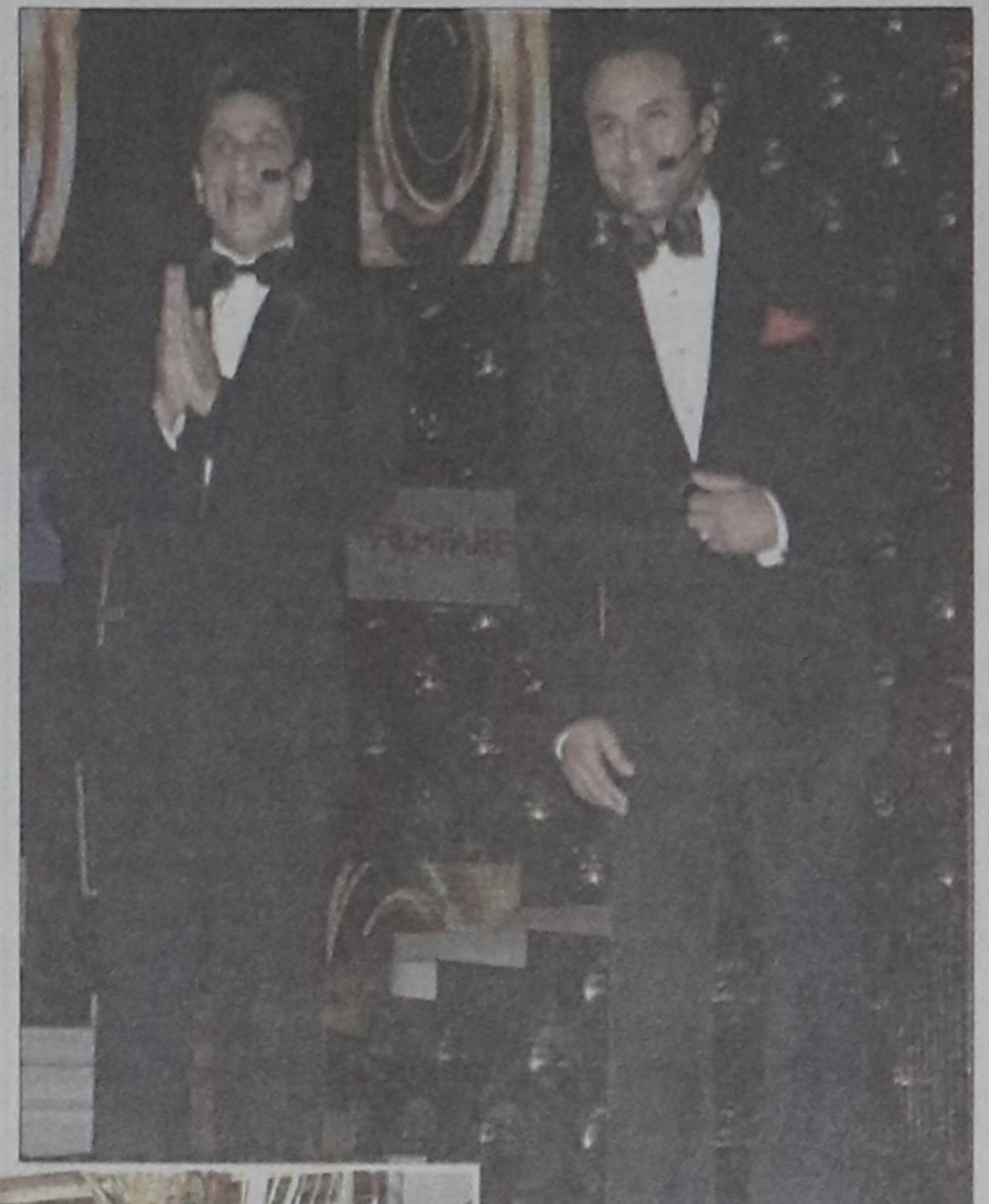
Shah Rukh and Saif at the Filmfare Awards (top), Kareena in Jab We Met

Child actor Darsheel Safary won the best actor (critics) award for his brilliant portrayal of Ishaan Awasthi, a dyslexic child in Taare