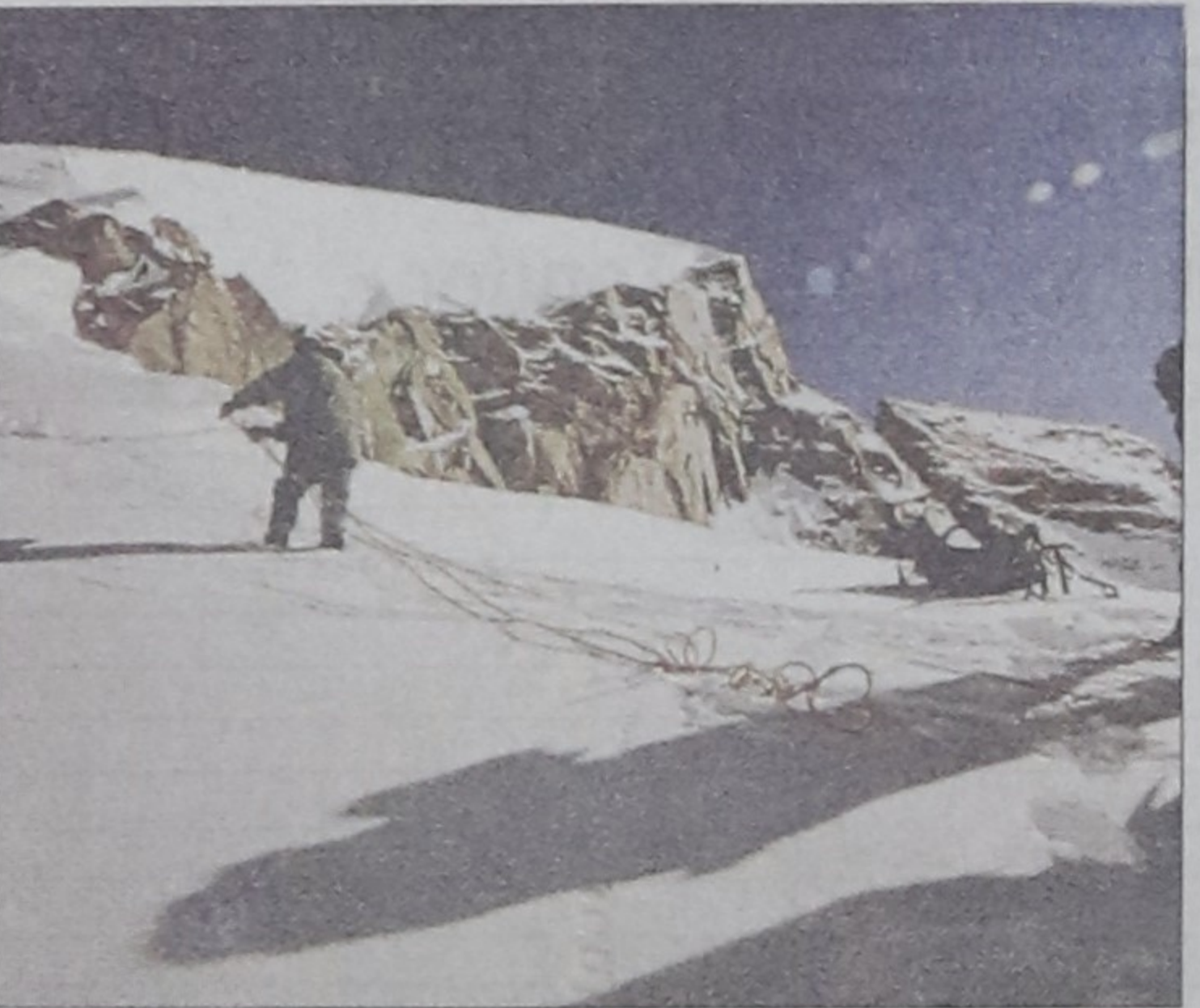
Endless sweeps of snow over the mountains captured through the lens