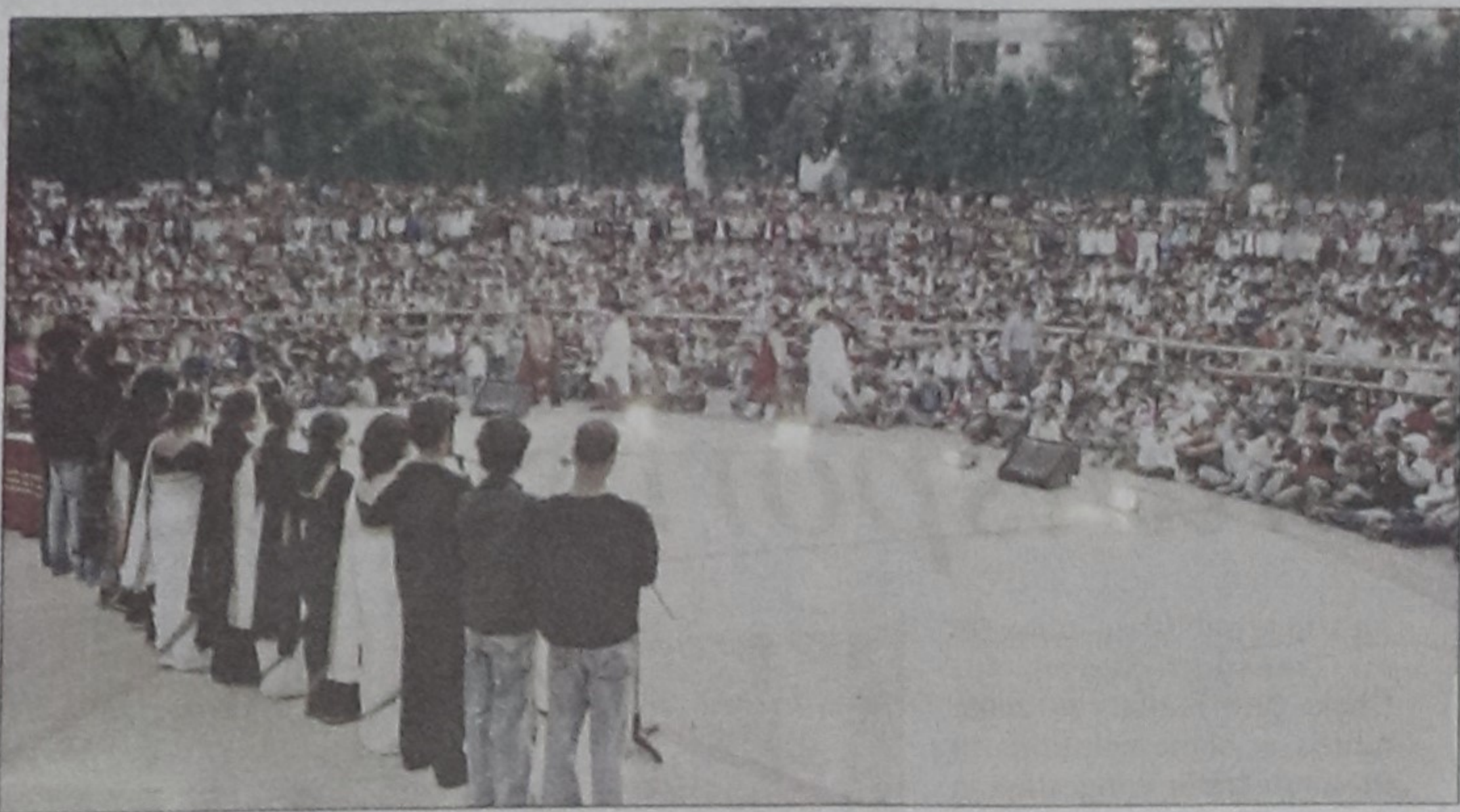
Hundreds of people through the open-air arena as artists perform at the programme

Weeklong celebrations by Sammilito Sangskritik Jote ends