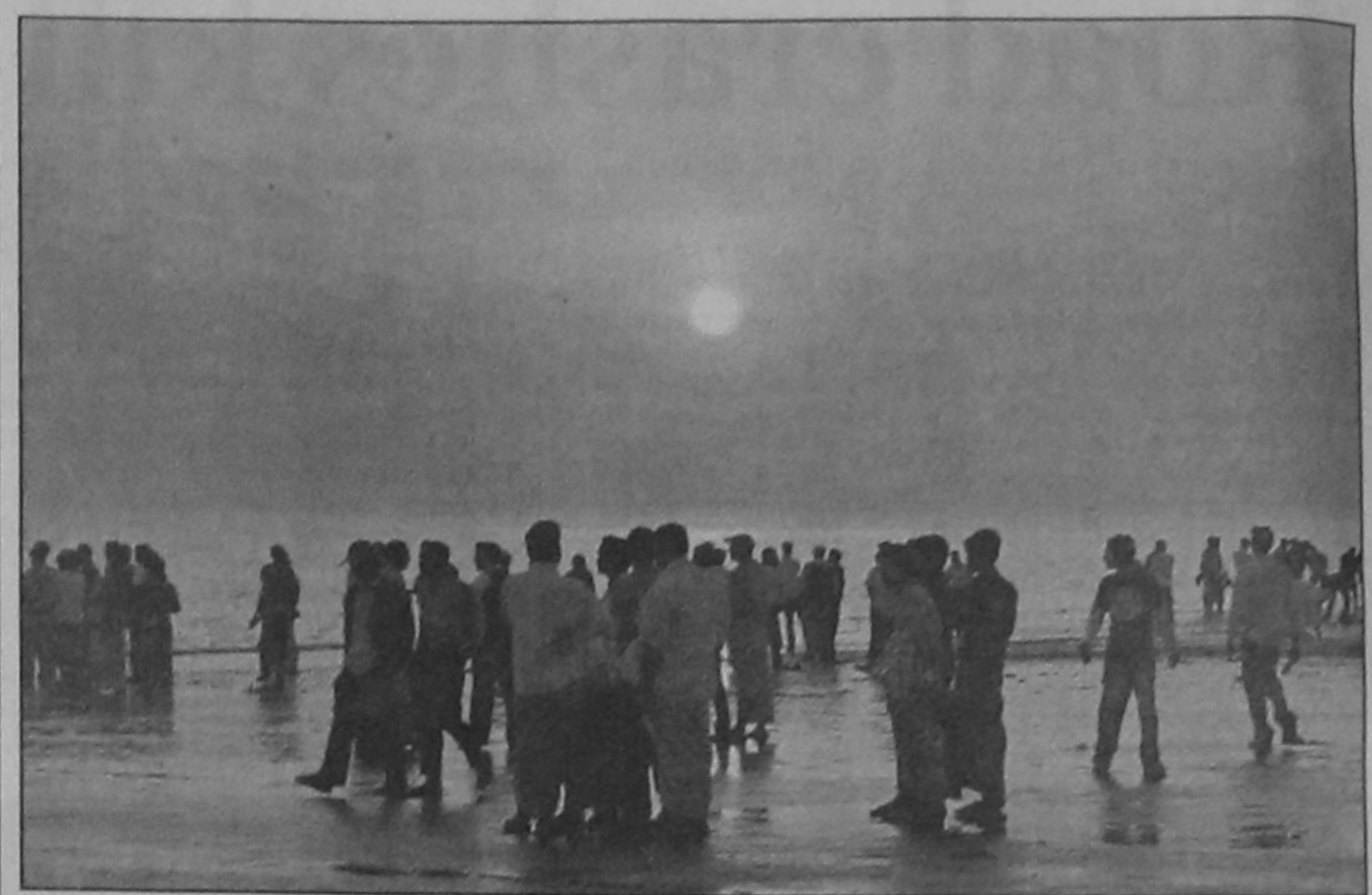
Picturesque Kuakata sea beach drew a large number of holiday-makers during three government holidays ending yesterday.

The arrested were being interrogated at Sadar police station till filing of the report yesterday afternoon.