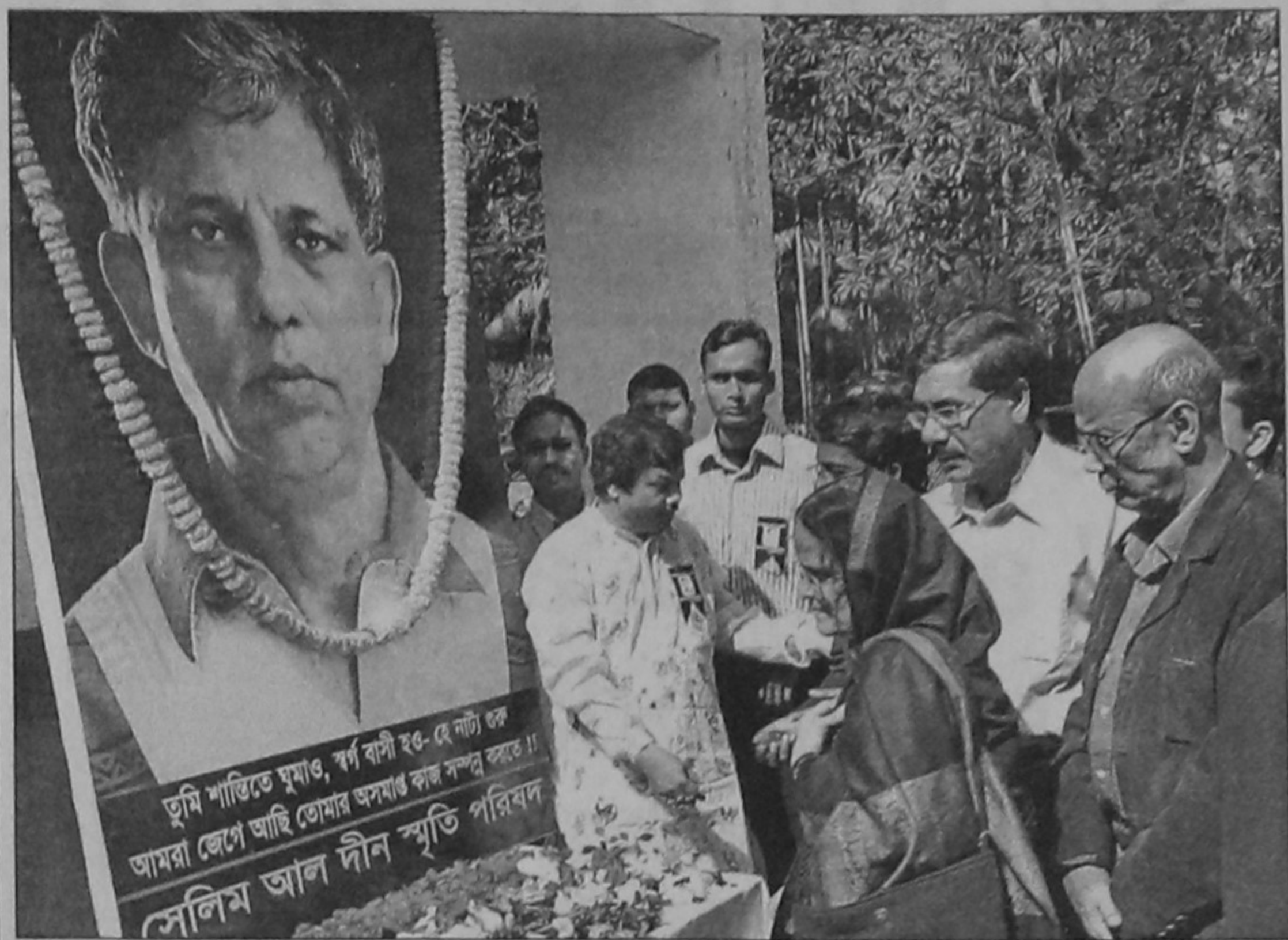
Participants of a memorial meeting pay floral tribute to eminent playwright Selim Al Deen at the National Press Club in the city yesterday. Selim Al Deen Smriti Parishad organised the meeting.