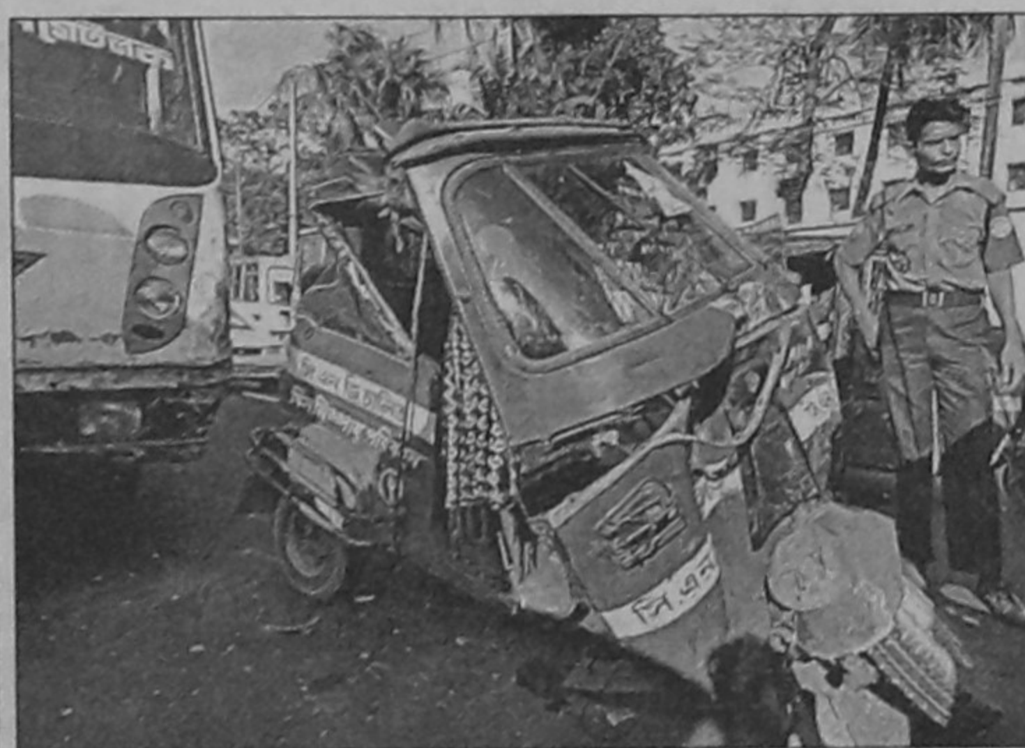
An autorickshaw was badly damaged when a speeding bus hit it at Shahbagh in the city yesterday. Popular writer and Deputy Editor of the Prothom Alo Anisul Huq, who was travelling in the three-wheeler, was injured in the accident.