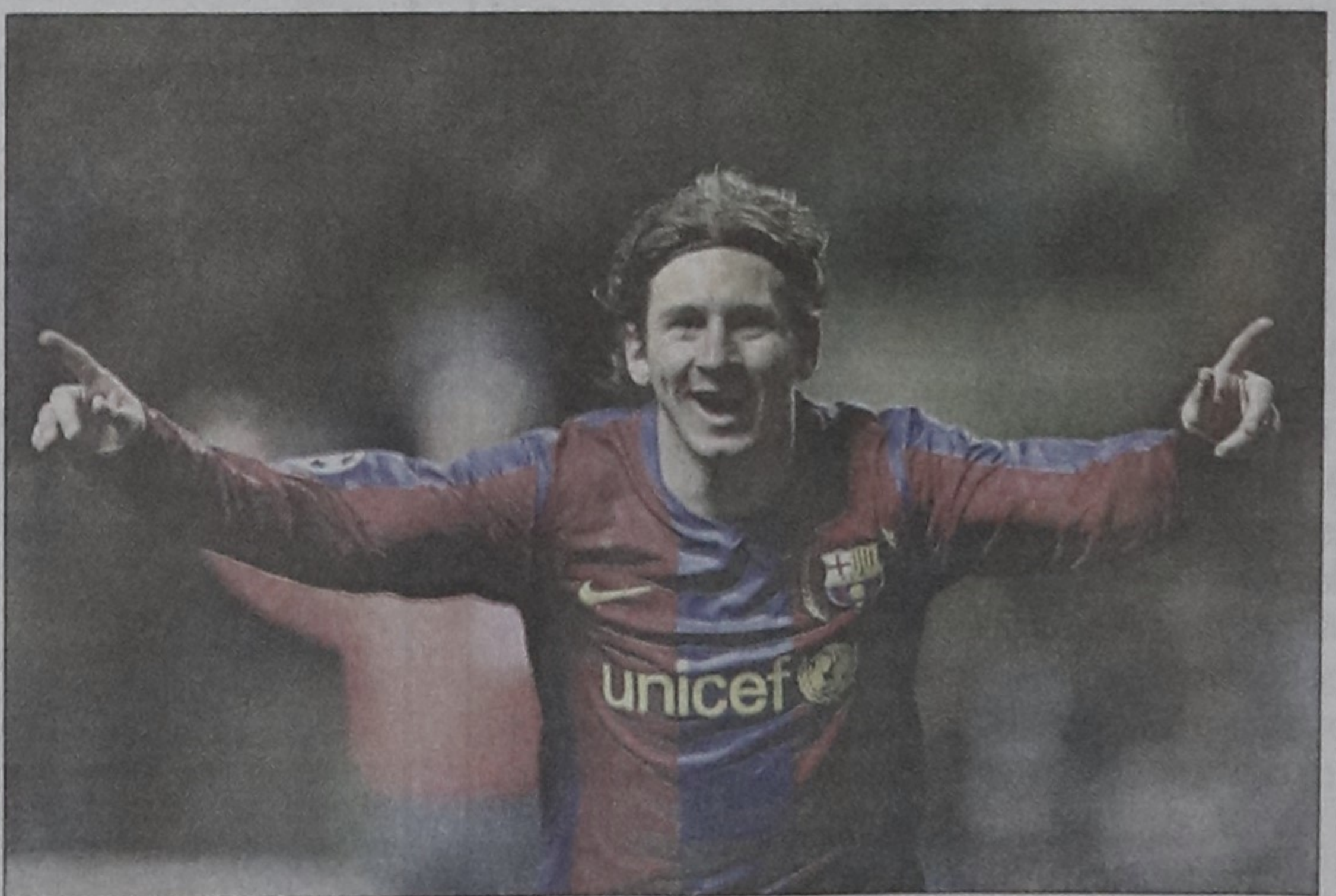
Barcelona sensation Lionel Messi celebrates scoring against Celtic in their Champions League encounter at Celtic Park on Wednesday.