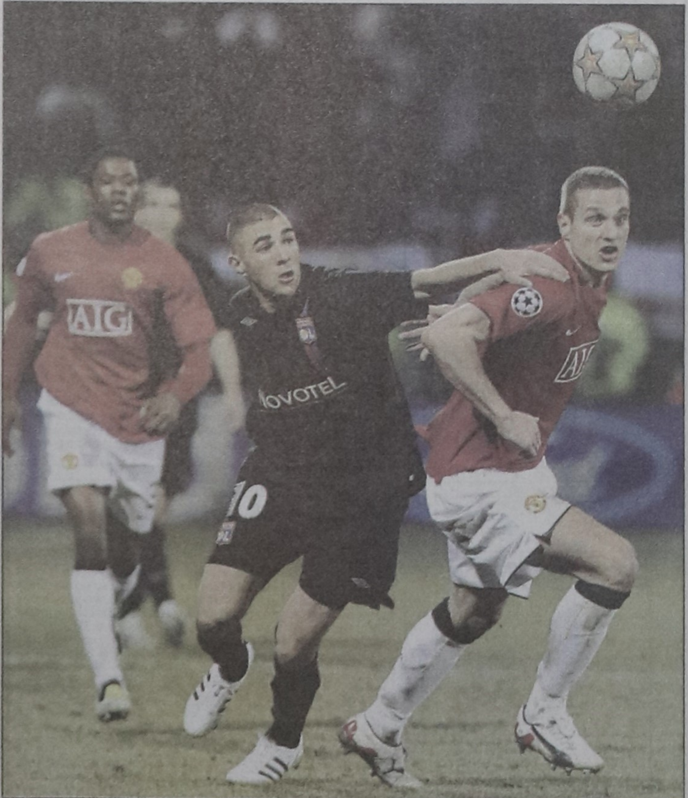
Lyon starlet Karim Benzema (C) tries to get the better of Manchester United defender Nemanja Vidic during their Champions League clash at the Stade Gerland on Wednesday.

"Maybe the 'dressing room' felt the need to prove people wrong. But their attitude was no different really to plenty of other games."