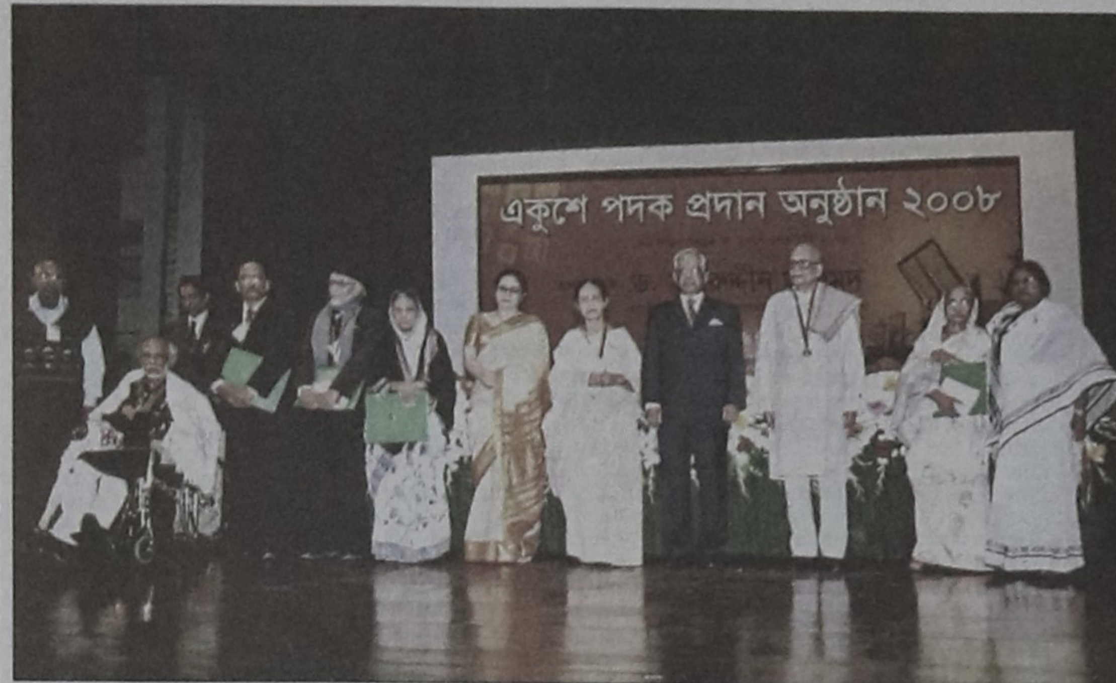
Chief Adviser Fakhruddin Ahmed (4th from right) is seen with the nine recipients of Ekushey Padak 2008 given away yesterday at Osmani Memorial Auditorium in the capital.