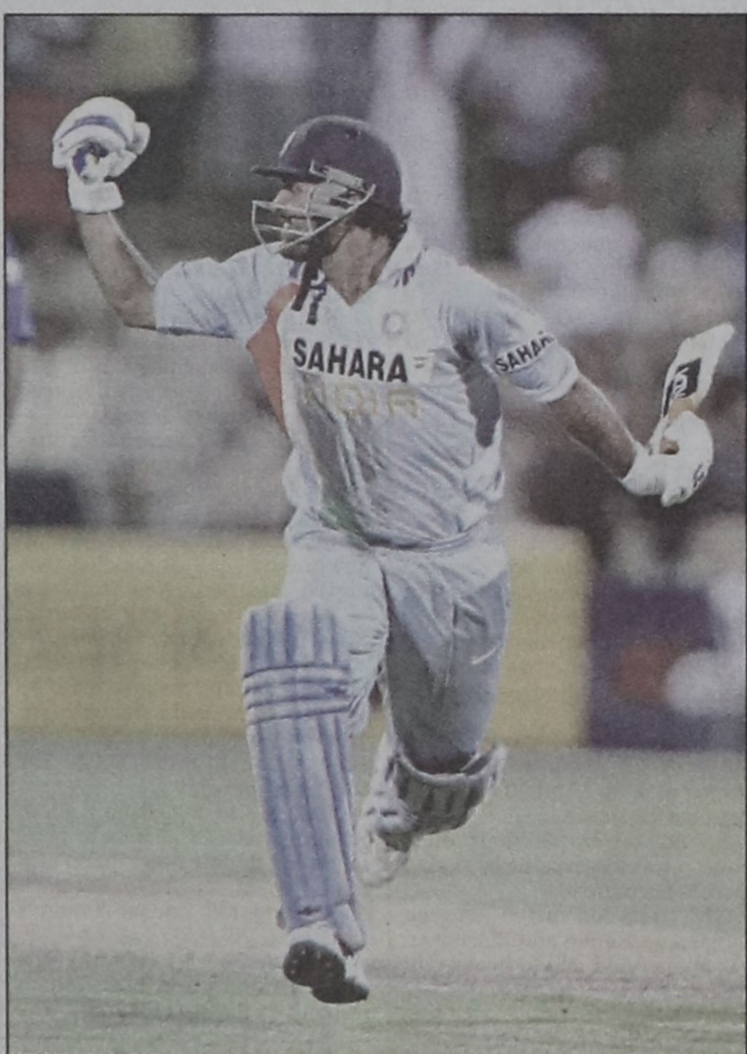
India captain Mahendra Singh Dhoni is ecstatic after picking up the winning runs in the final over of a nail-biting CB Series match against Sri Lanka in Adelaide yesterday.