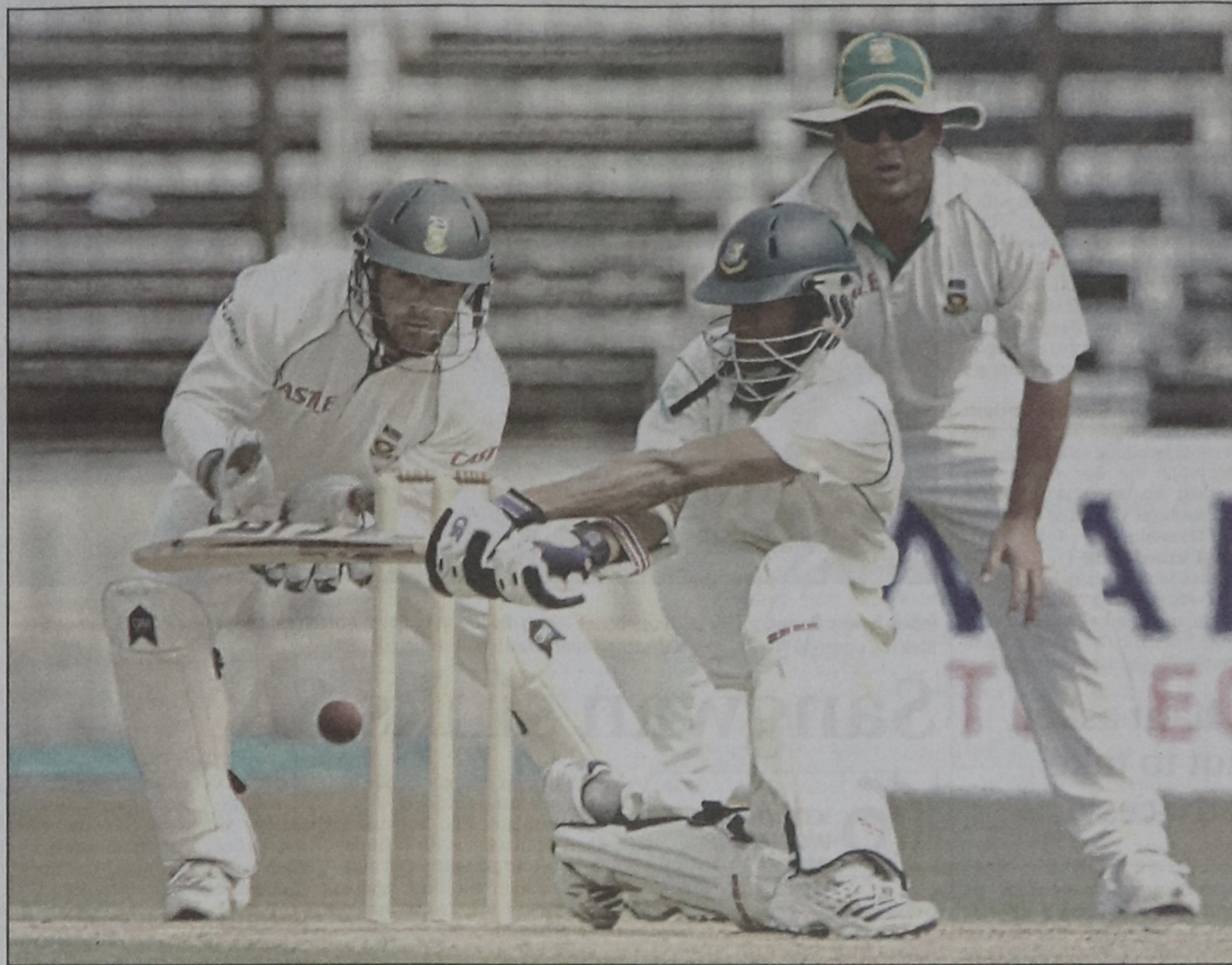
SUBLIME SHAKIB: BCB Eleven captain Shakib Al Hasan sweeps the ball fine as South Africa wicketkeeper Mark Boucher (L) and Jacques Kallis look on on the final day of the three-day warmup match at the Fatullah Cricket Stadium yesterday.