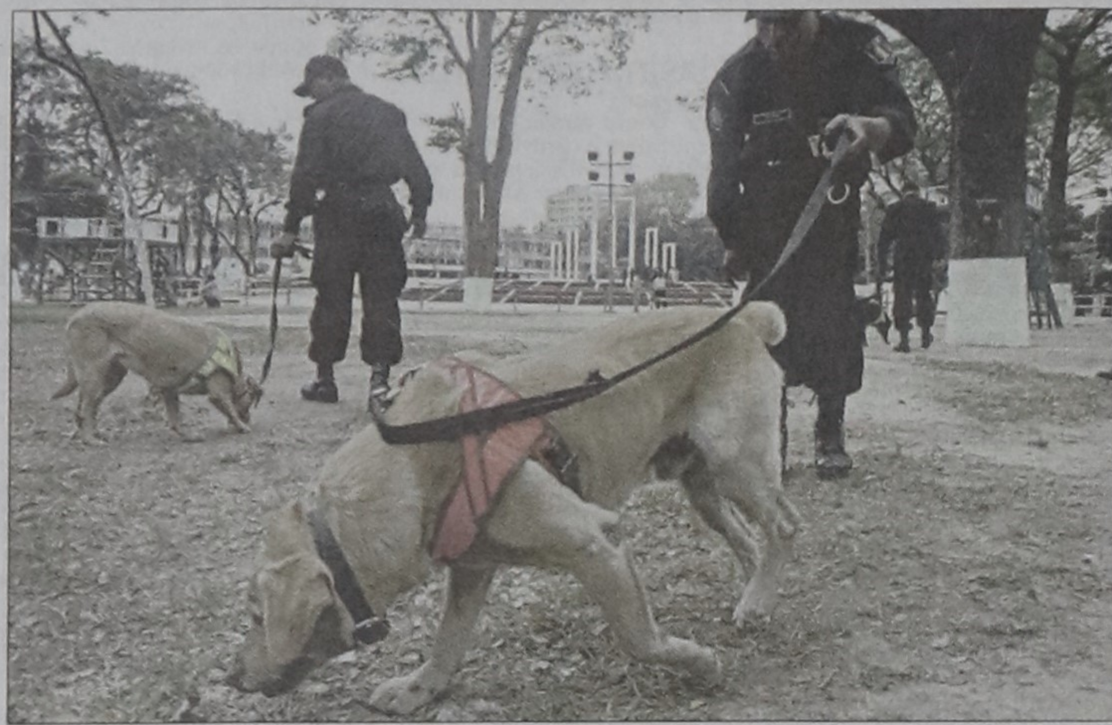
Law enforcers using sniffer dogs conduct a search at the Central Shaheed Minar in the capital yesterday to ensure security for people paying homage to the Language Movement martyrs tomorrow.