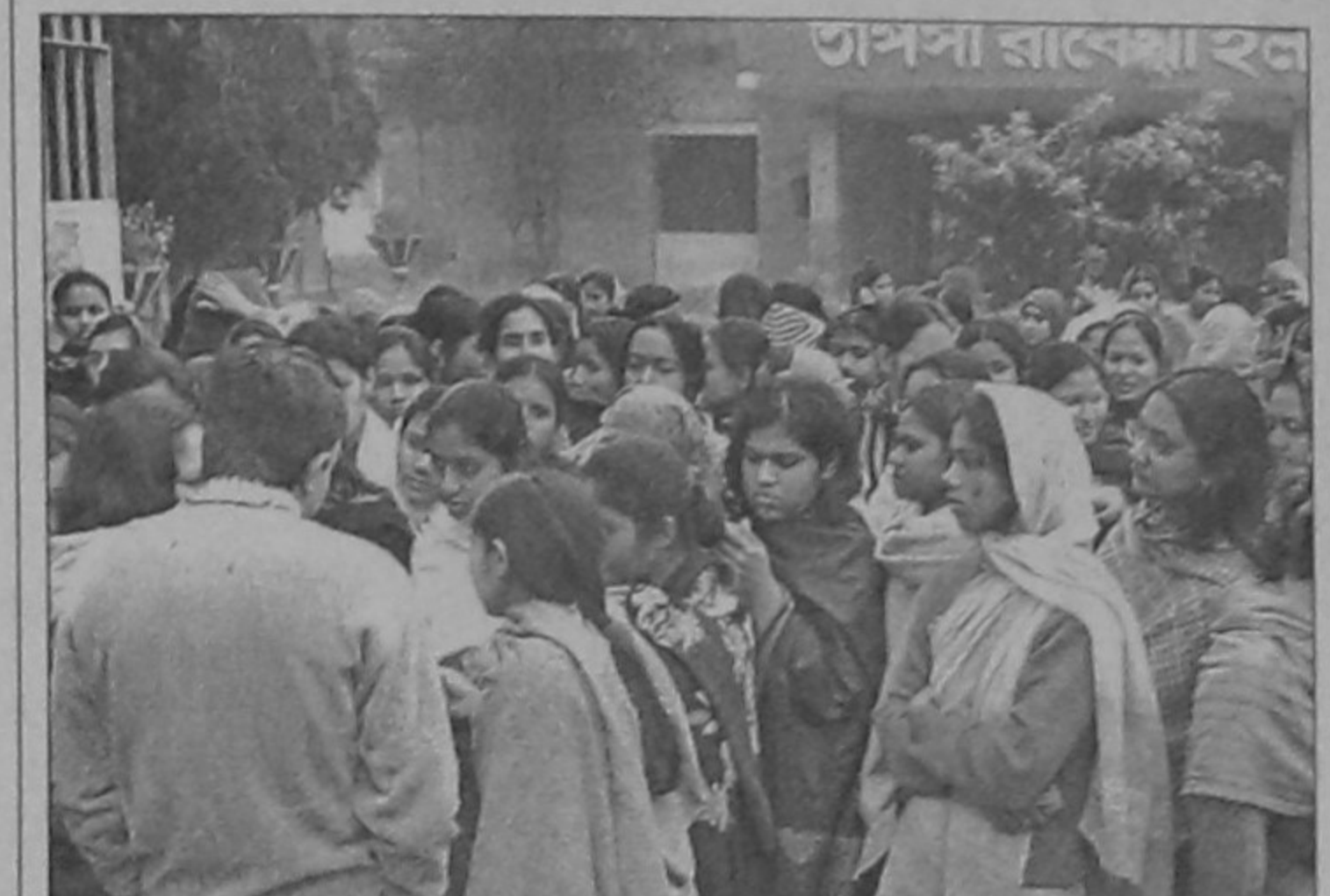
Students of Tapasi Rabeya Hall in Rahshahi University complaining to administrative officials after a burglar injured a resident of the female dormitory yesterday morning.

Students have alleged quite a few incidents of intrusion by outsiders and thieves into residential halls.