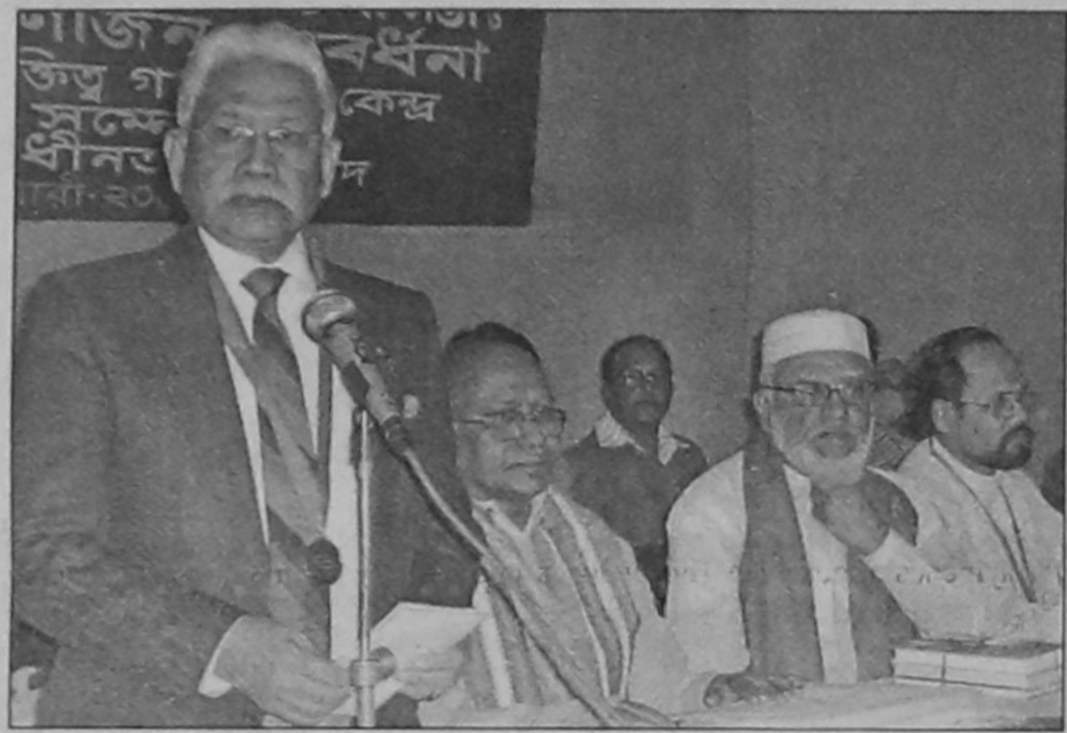
Maj Gen (ret'd) KM Shafiullah speaks at a discussion on 'Language movement and the liberation war' at the National Press Club in the city yesterday.

Middle of the eclipse will occur at 09 hours 26 minutes BST. The maximum magnitude of the eclipse will be 1.111.