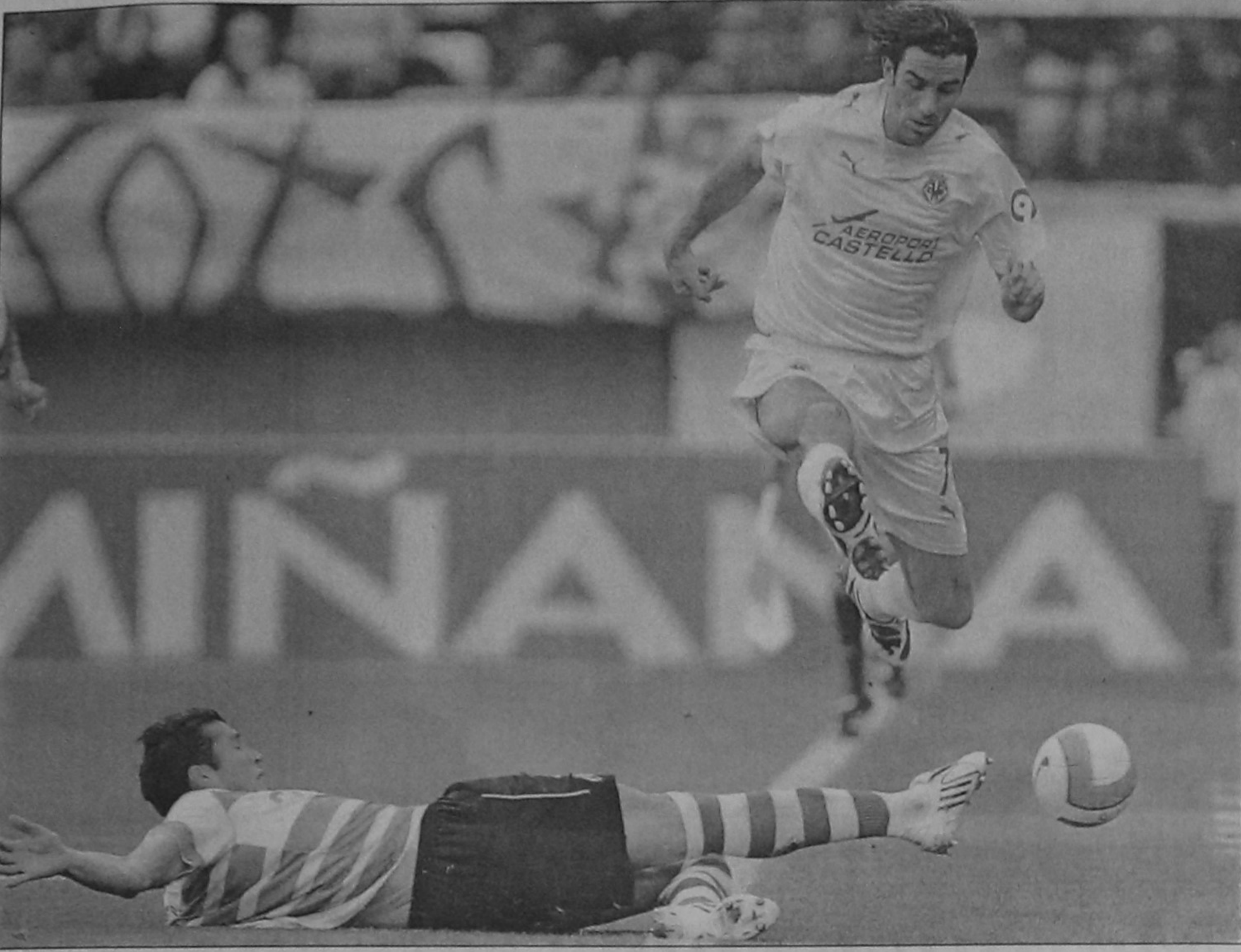
Villarreal winger Robert Pires (R) hurdles the challenge of Racing Santander defender Ezequiel Garay during their Primera Liga clash at El Madrigal on Sunday.