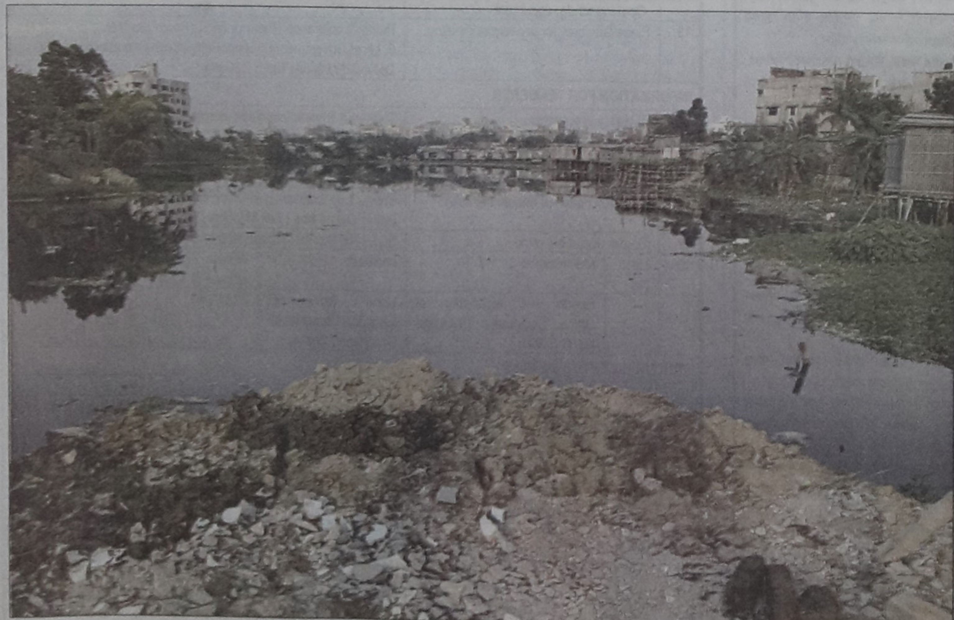
Encroachment on Rupnagar canal in Mirpur continues due to delay in restoration work.