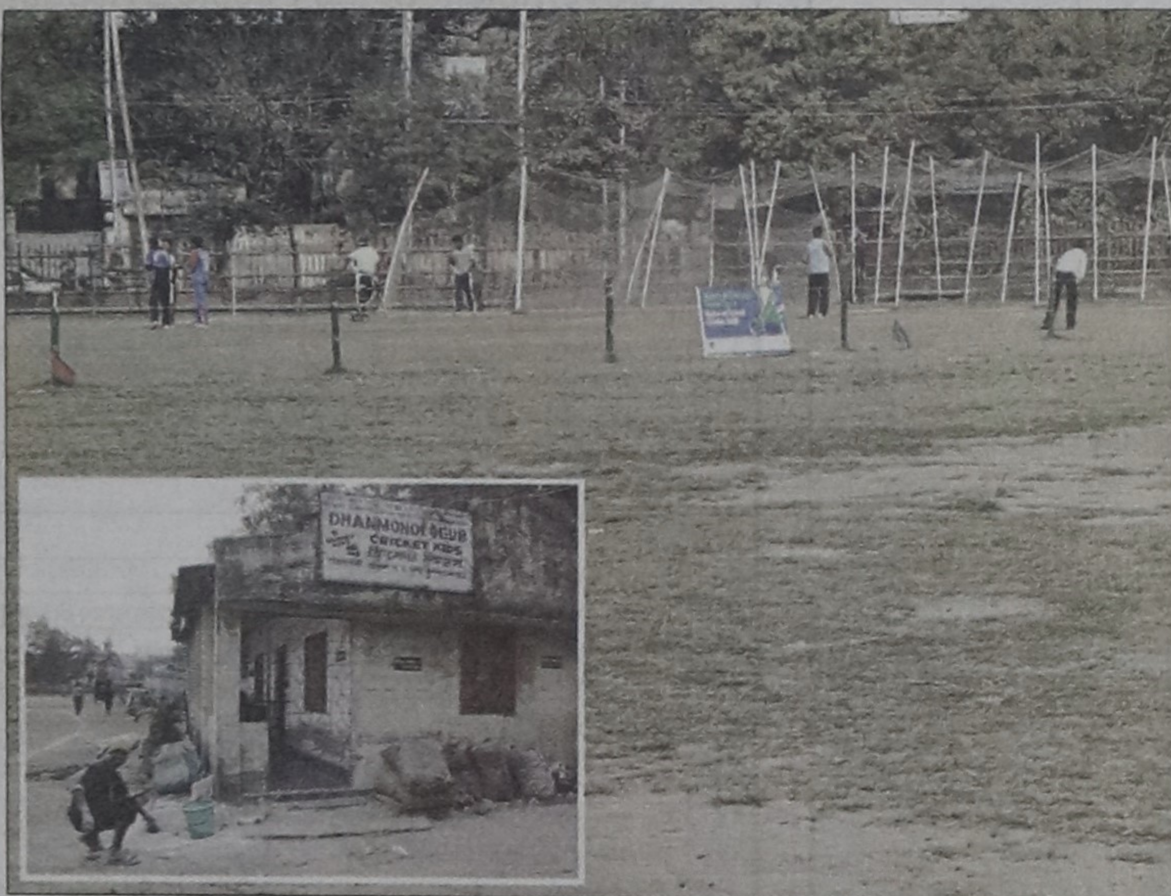
The Dhanmondi playground and, inset, an unauthorised structure on it.