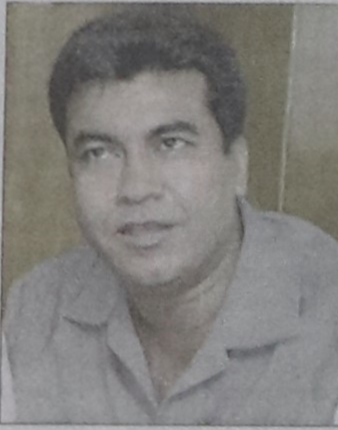
movies such as Anonto Prem . He was a great actor and a great human being."

Film actor Moushumi said, "We had performed in several popular