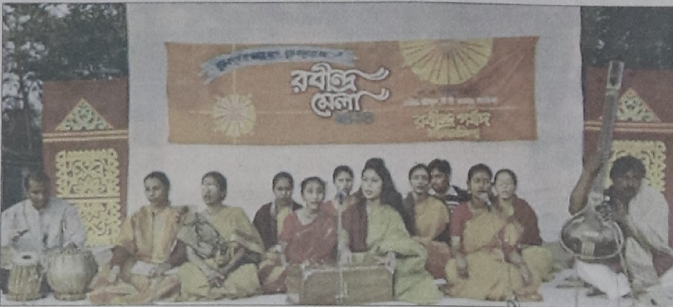
Artists of Shishutirtha Anandodhani sing at the programme

A colourful rally was brought out in the district town on the occasion.