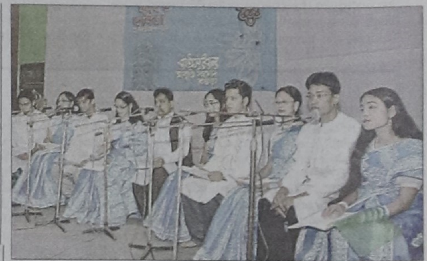
Kanthoshadhan Abritti Sangsad held a programme recently, featuring recitation of works by poets who have evolved in the greater Bogra region, between the '40s and '70s. The programme was held at the Bogra Zilla Parishad Auditorium

Nine of Farocki's films were recently screened at the Goethe-Institut in Dhaka.