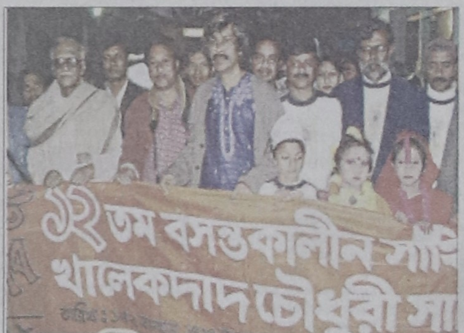
A rally brought out by Netrakona Sahitya Samaj