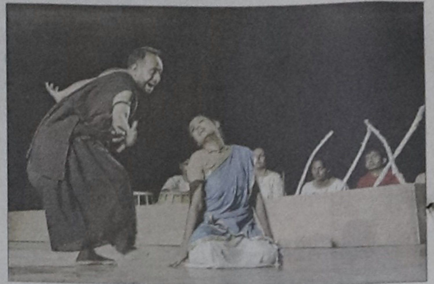
A scene from the play Rupobati

At the Experimental Theatre Stage, BSA, South Asian Ibsen Centre from Chittagong will stage Ichchha Mrityu , a translation of the Ibsen play