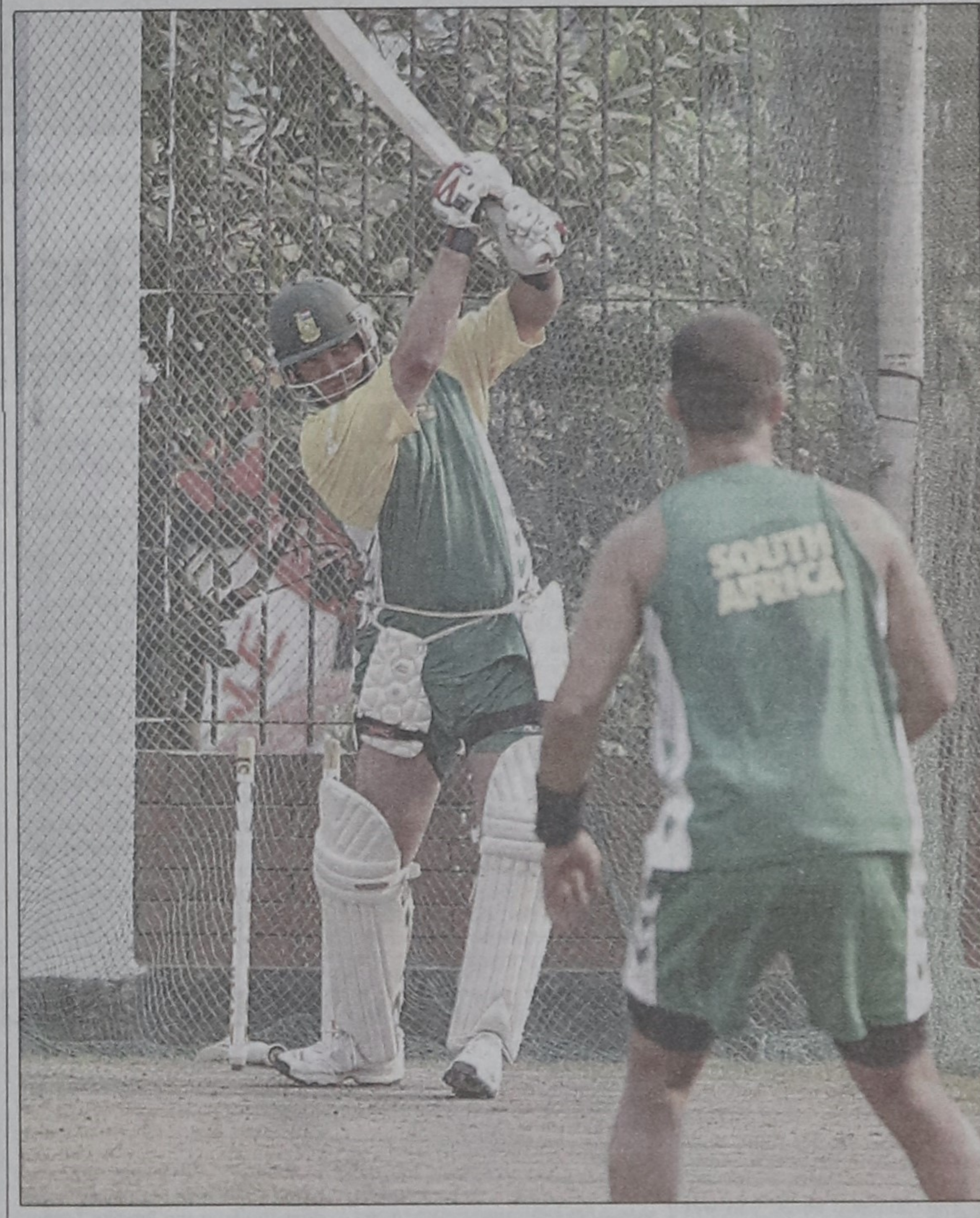
STAND AND DELIVER: South Africa all-rounder Jacques Kallis knocks in the nets during a practice session at the Sher-e-Bangla National Stadium in Mirpur yesterday.

Arambagh Krira Sangha take on Victoria while Badda Jagarani face Sunrise Sporting Club.