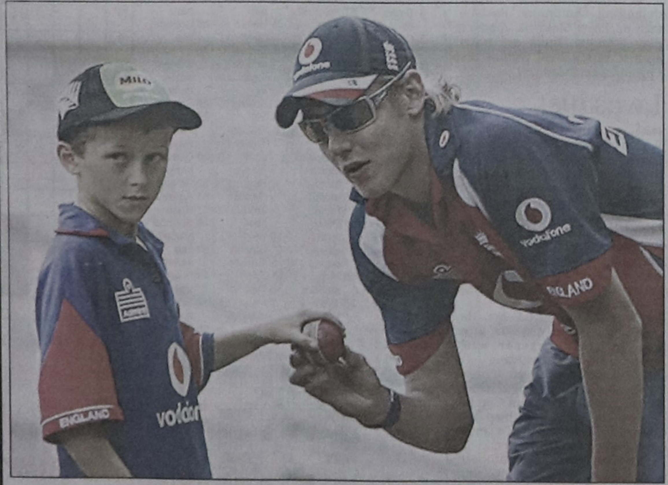
England pacer Stuart Broad gives bowling tips to a young boy at a coaching clinic in Auckland yesterday.