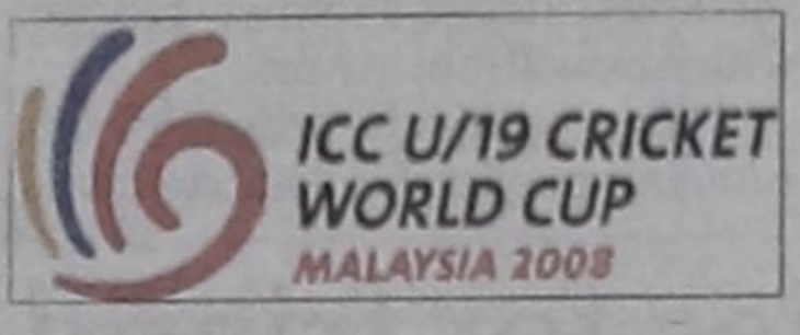
AFP, Kuala Lumpur

Cricket's brightest young talent will not be short of inspiration when they contest the International Cricket Council's under-19 World Cup starting here on Sunday.