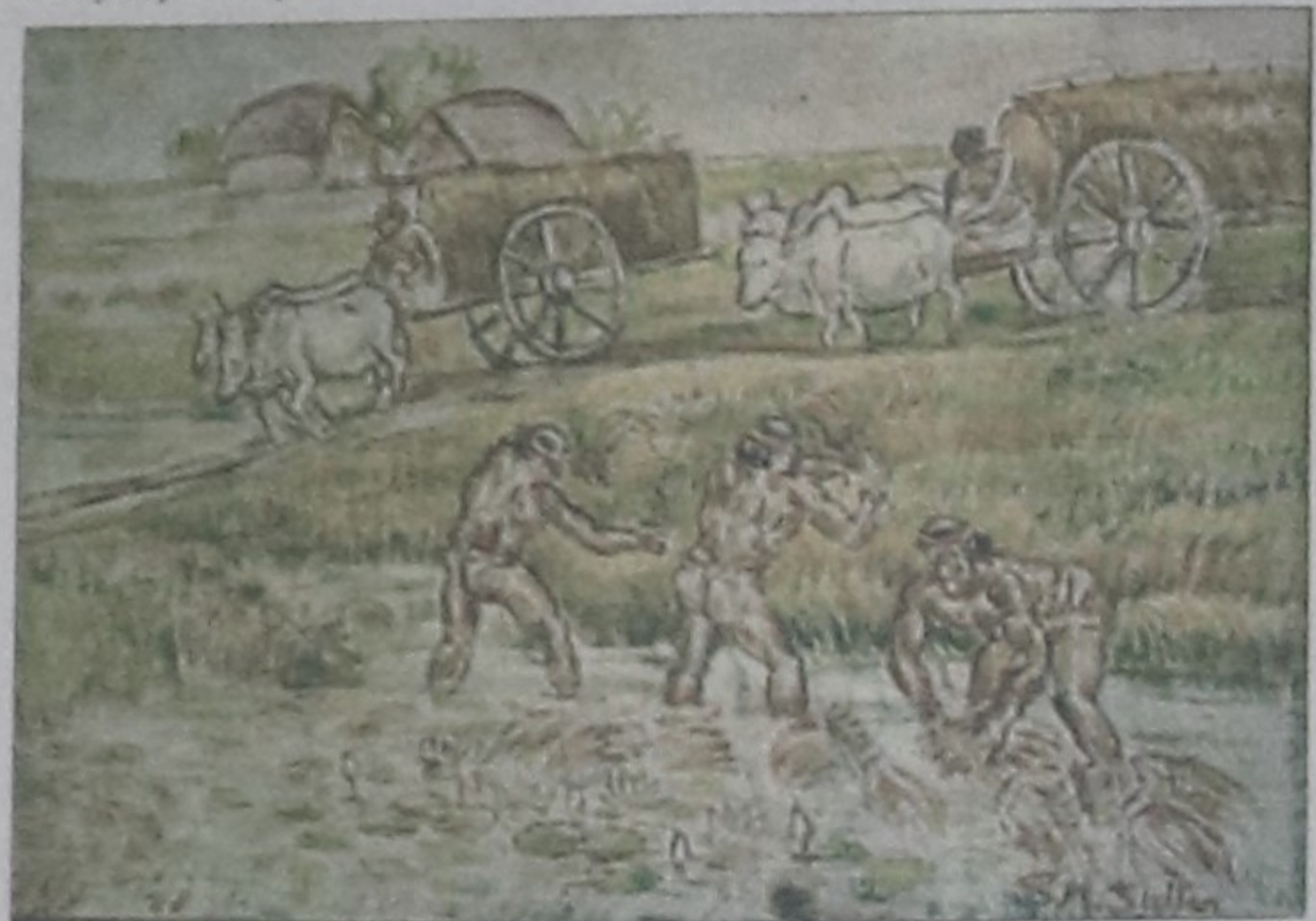
Artwork by SM Sultan

SM Sultan passed away in February, 10, 1994. On the occasion of his 83rd birth anniversary, this fair has been arranged at the premises of Sultan Mancho.