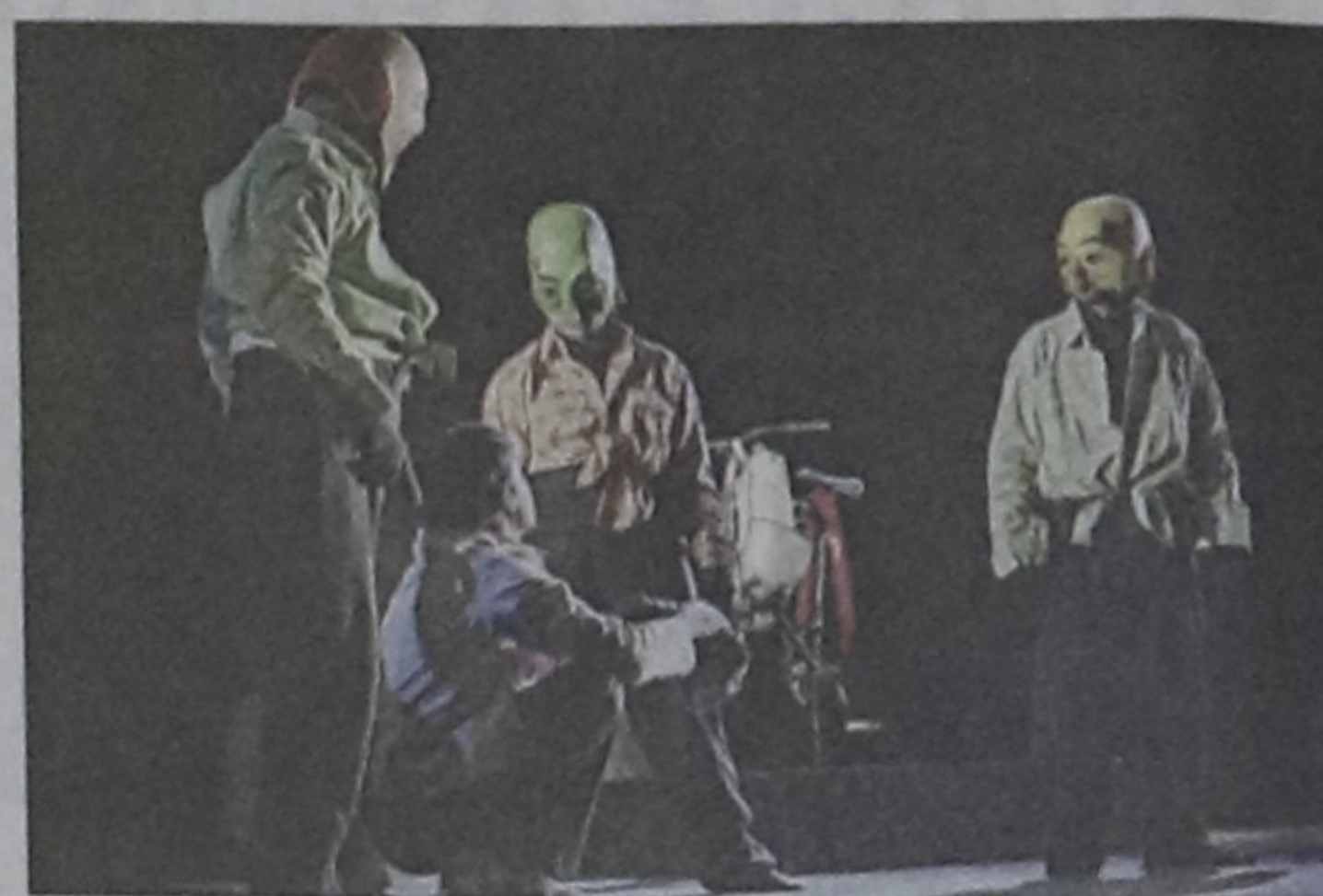
A scene from the play Cyclewala