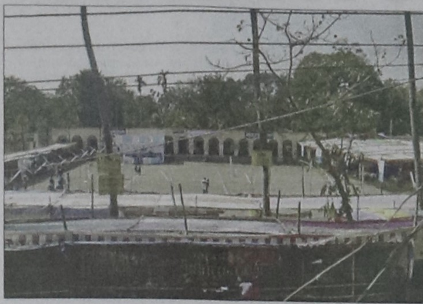
A view of the Narail Victoria College premises, the venue of the fair

Kolkata. In 1943, he joined in "Khaksha" movement. In 1943, his solo art exhibition was held in Simla, India. In 1948 Sultan's solo art exhibition was inaugurated in Lahore, Pakistan, by Fatima Jinnah. In 1950, as a representative of Pakistan government, he participated at an international conference of artists in America.