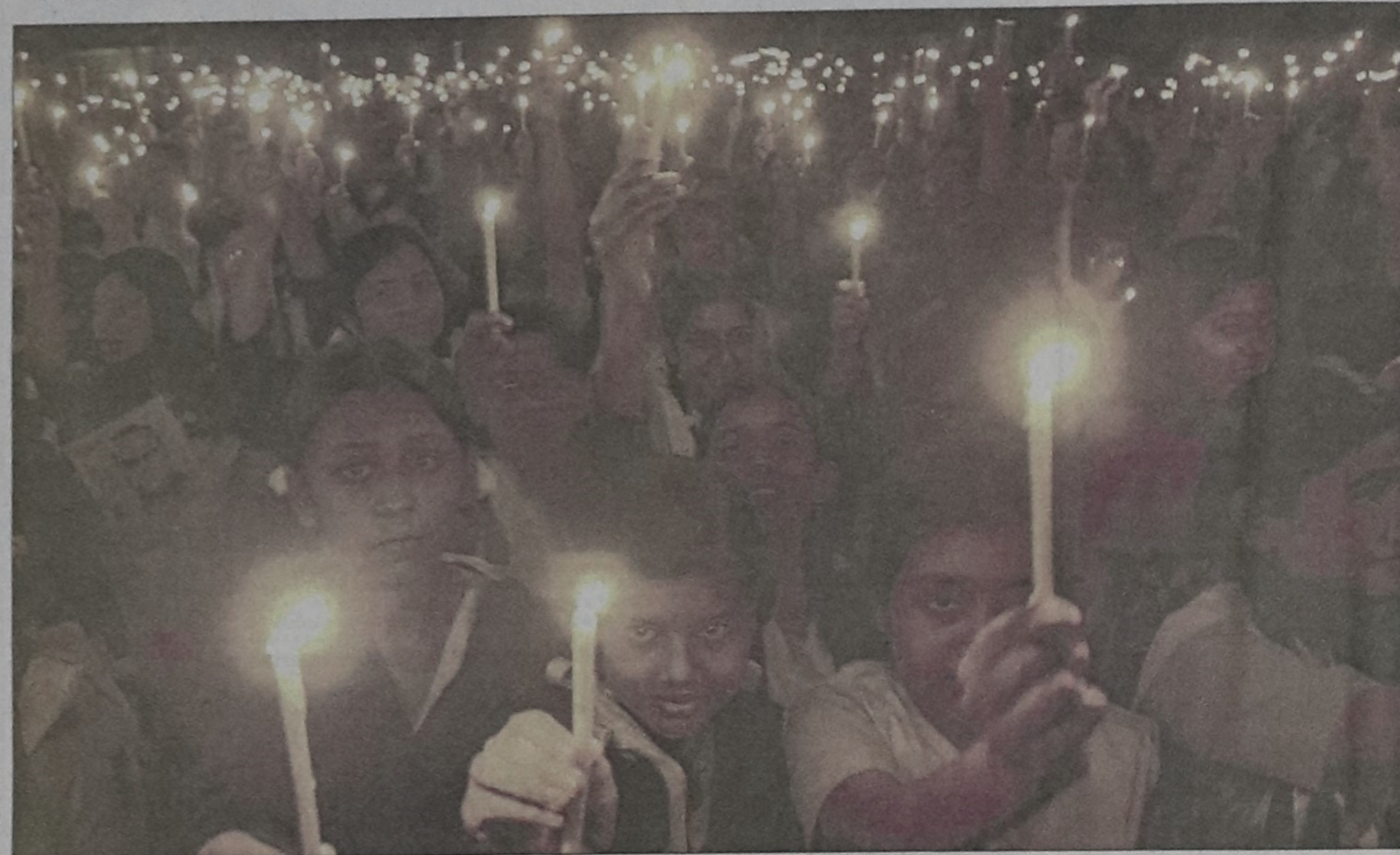
Students hold up lighted candles at the closing session of the prize distribution ceremony of 'Book Reading Programme' of Biswa Sahitya Kendra at Ramna Batamul in the city yesterday.