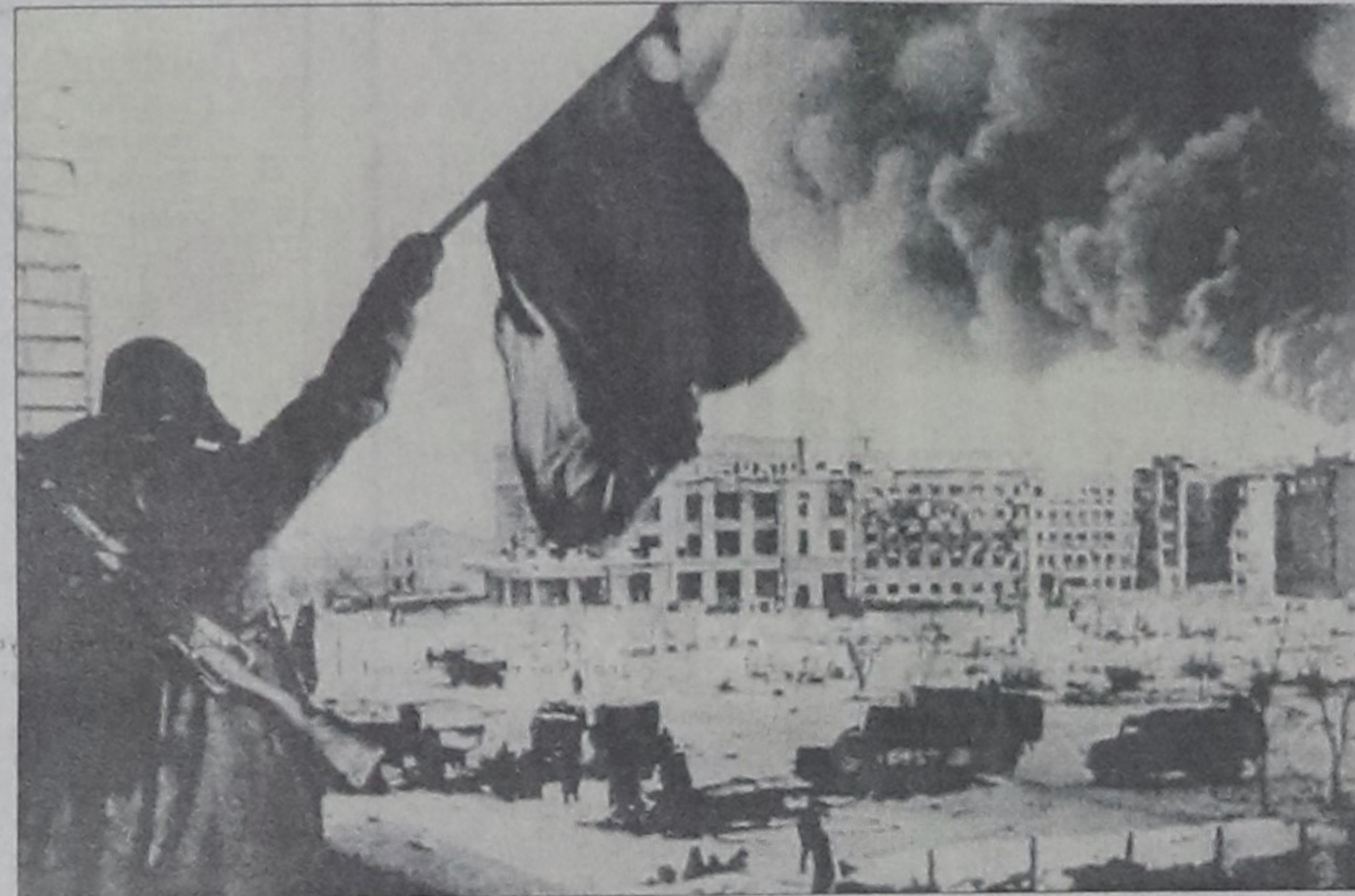
Photographs seen at the display

Photographs portraying the havoc caused by the invading forces, the struggle of the defending soldiers and the average Russians, and the ultimate surrender of Field Marshal Friedrich Paulus are all included in the show.