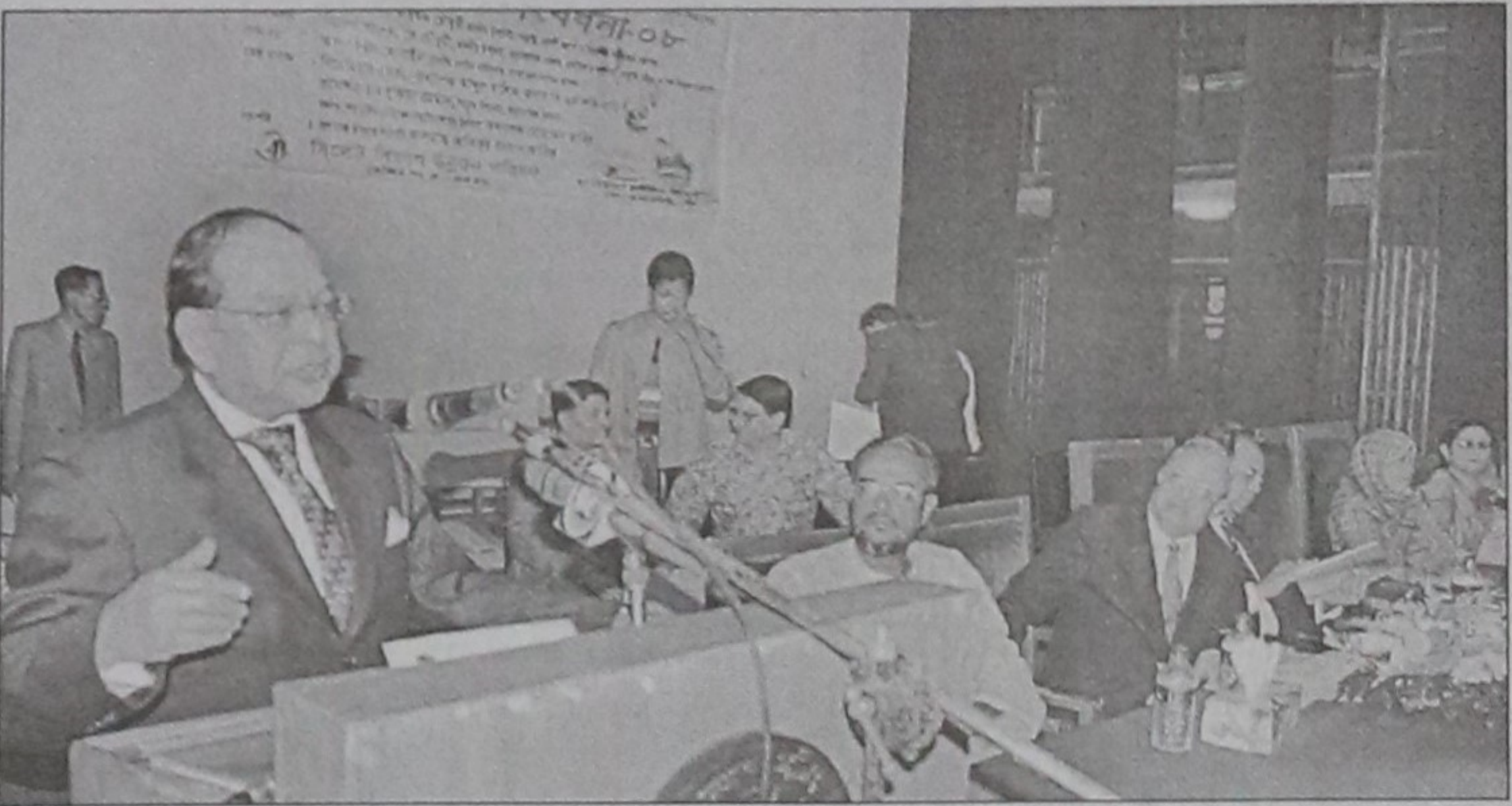
Foreign Adviser Iftekhar Ahmed Chowdhury speaks at a reception ceremony for meritorious students at the Engineers' Institute auditorium in the city yesterday. Sylhet Division Development Council accorded the reception to students from Sylhet who achieved excellent results in the SSC and HSC examinations.

Radio Foorti was the radio partner of the competition.