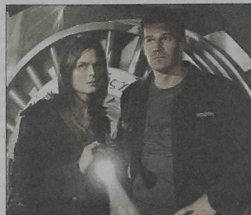
Bones On Star World at 10:30 pm TV Series Cast: David Boreanaz, Emily Deschanel

All programmes are in local time. The Daily Star will not be responsible for any change in the programme.