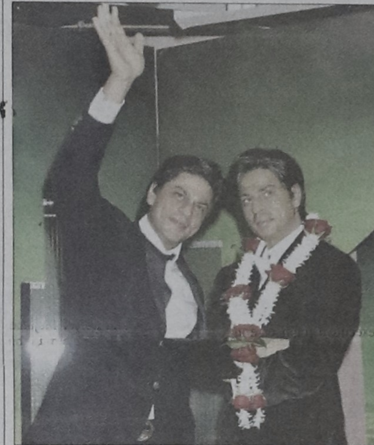
Sharukh Khan with his wax double at Madame Tussauds

The director of Berlinale (Berlin International Film Festival, from February 7 to 17) Dieter Kosslick has invited Bollywood star Sharukh Khan without probably realising how enormous an impact this would have. In a few days 32,000 e-mails were sent to the Berlinale organisers enquiring about Sharukh. Many youngsters from all parts of Europe have announced that they want to meet him personally.