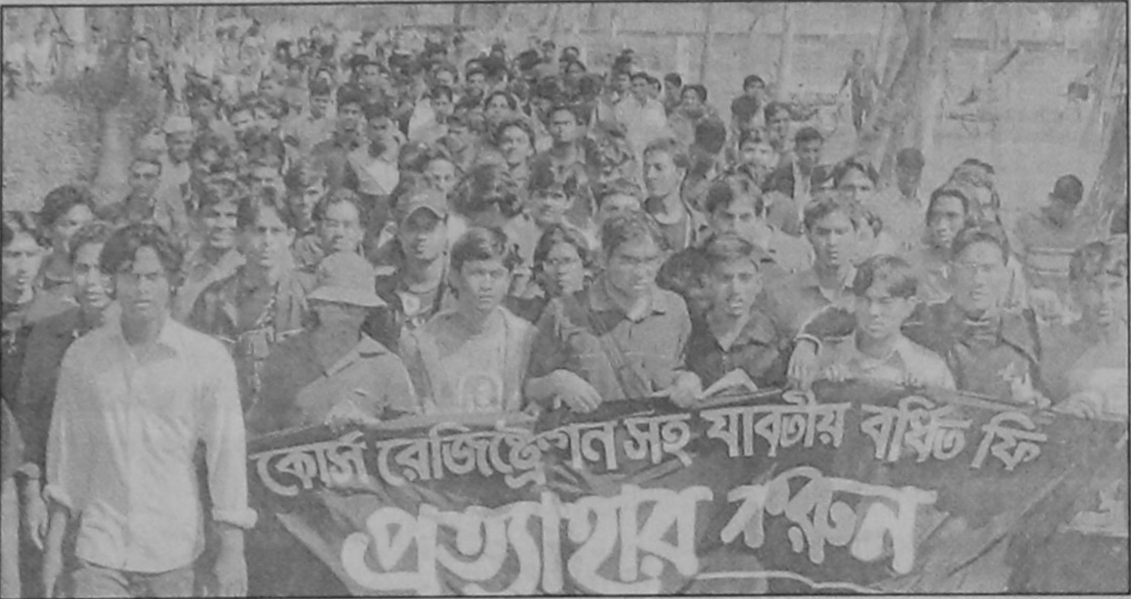
Khulna University students bring out a demonstration on the campus yesterday demanding cancellation of increased fees.

The AED official said, about one lakh hectares remain uncultivated in Sylhet district. This year for the first time, about 25,000 hectares are being brought under Boro.