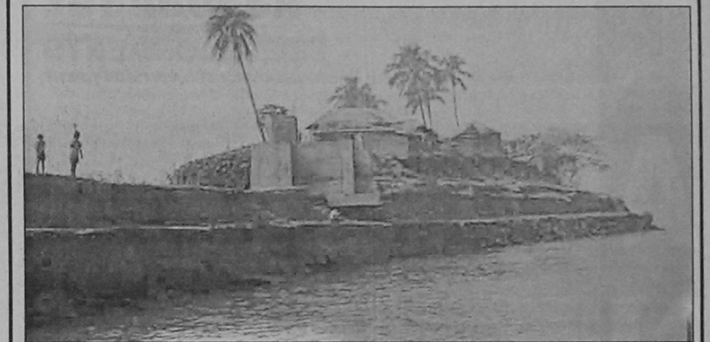
Shimulbagh village in Itna upazila in Kishoreganj being devoured by haor.