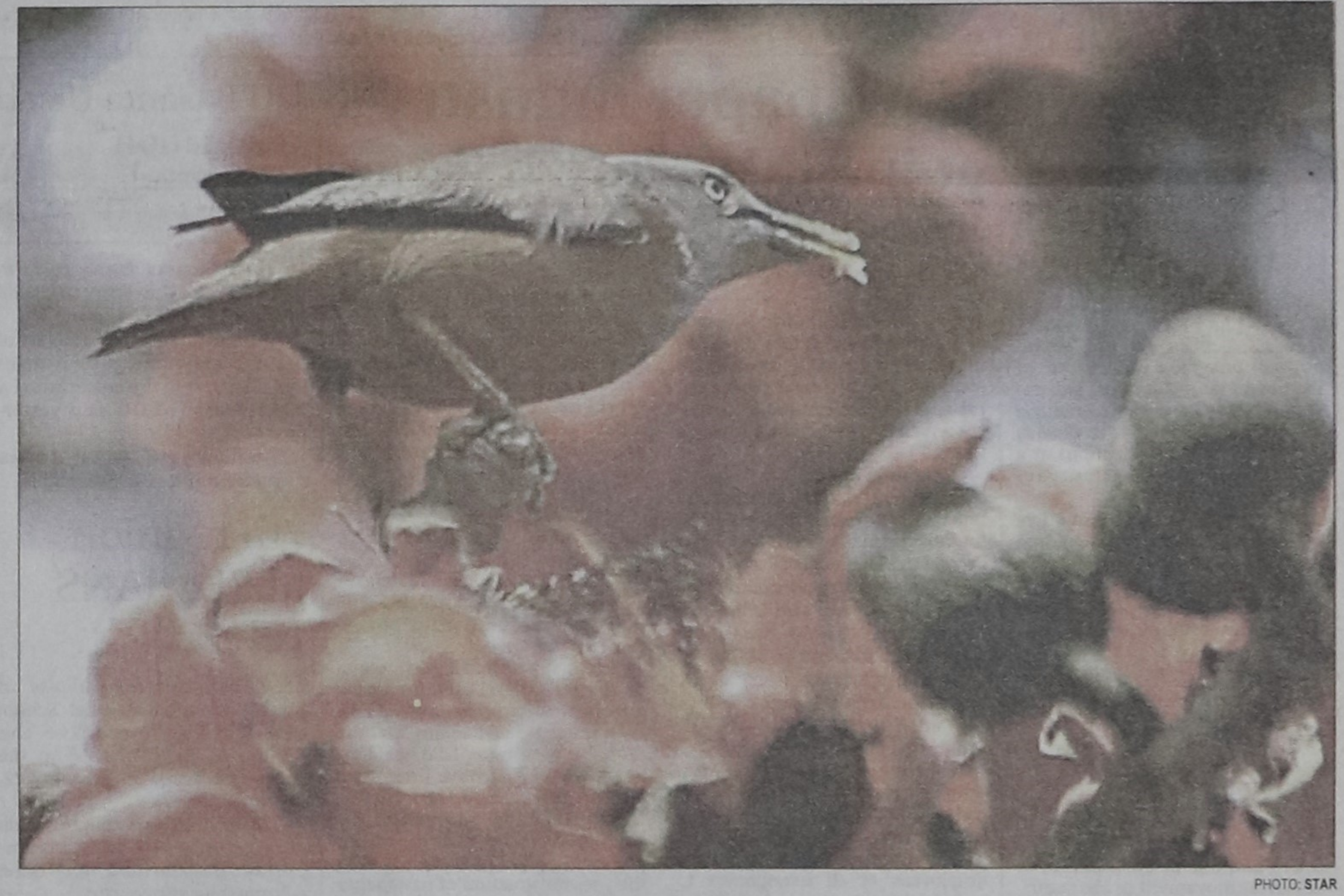
A bird perched on a silk-cotton flower sips honey from the blossoms that heralds the beginning of spring today.

STAFF CORRESPONDENT Awami League (AL) and Samyabadi Dal, allies in 14-party coalition, yesterday decided to help the caretaker government to hand over state power to an elected government through holding of the stalled 9th parliamentary election in line with the electoral roadmap announced by the Election Commission. In a bilateral meeting held in AL Acting President Zillur Rahman's residence, both parties demanded that the government holds dialogues with political parties as early as possible without imposing any condition. In the meeting chaired by Zillur, both parties also decided to have a meeting with the caretaker government to hand over state power to an elected government through holding of the stalled 9th parliamentary election in line with the electoral roadmap announced by the Election Commission. SEE PAGE 15 COL 6