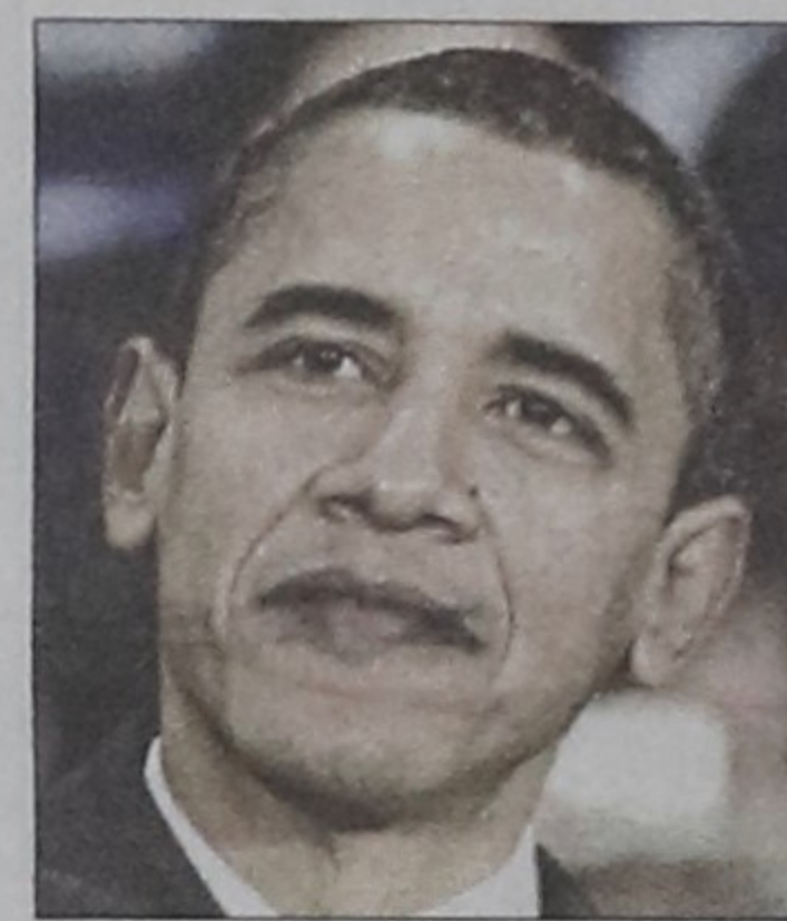
Sen Barack Obama

He jabbed simultaneously at Clinton and Arizona Sen John McCain, saying the election was a choice between debating the Republican nominee-in-waiting