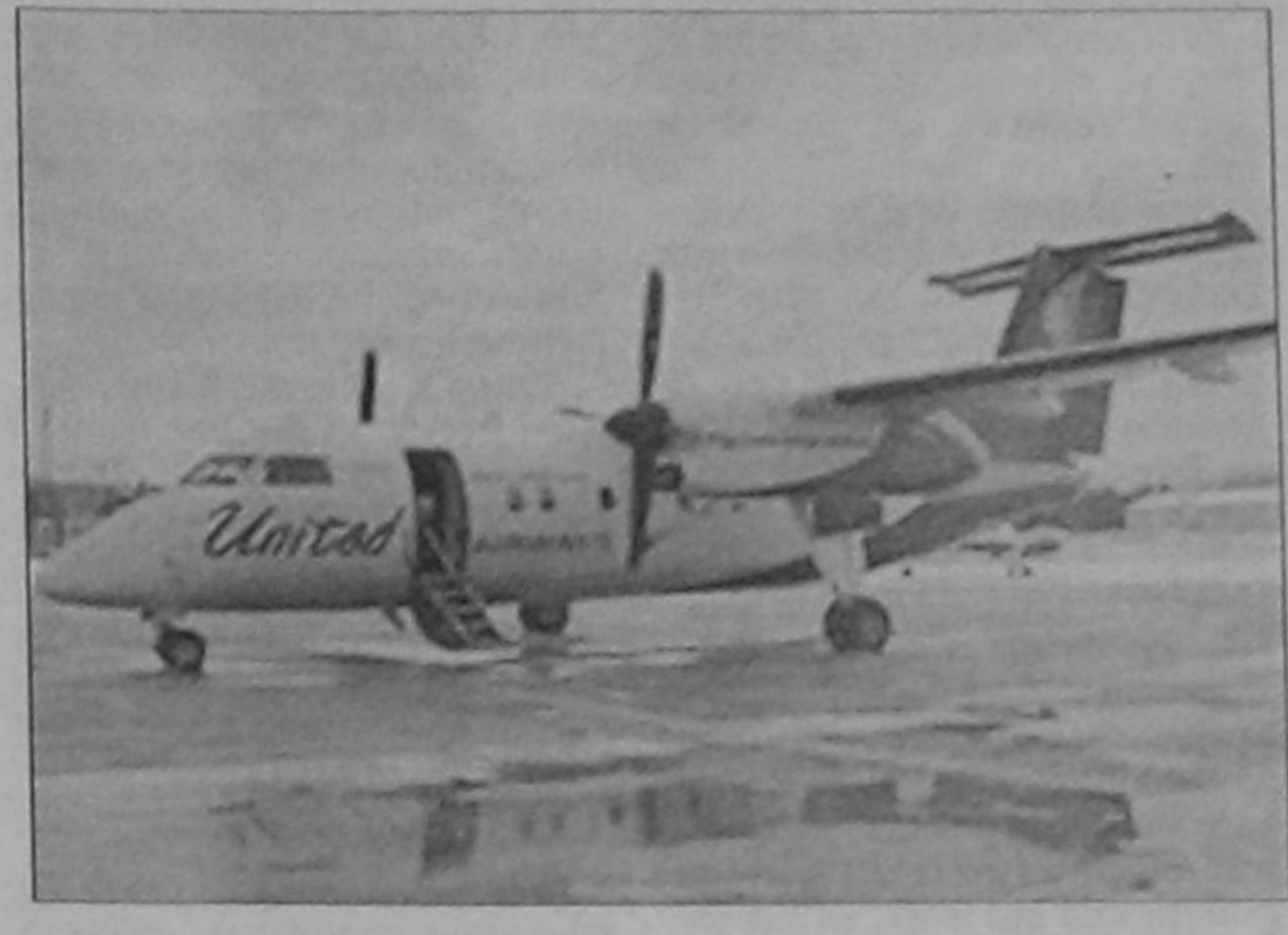
An aircraft of local United Airways. The carrier is going to strengthen its fleet to compete on domestic and international routes.

United Airways is to add two wide-bodied aircraft to its fleet to operate on international routes.