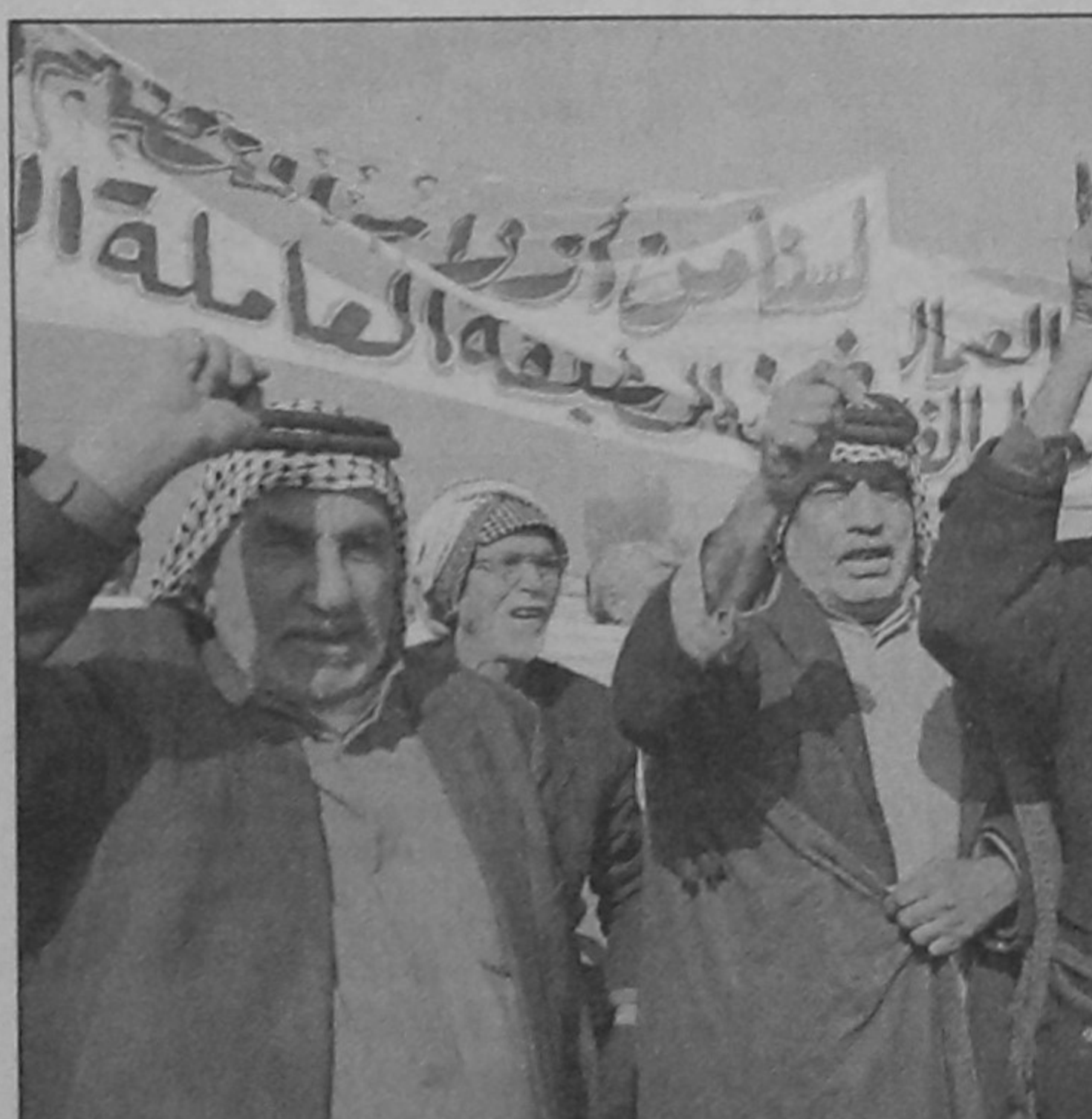
Iraqi men shout slogans during an anti-US rally in Baghdad's impoverished district of Sadr City on yesterday. The demonstrators asked for the evacuation of US troops from a nearby tobacco factory, which they occupied and transformed into a military post.

AFP, Kathmandu There is a lot of jealousy and rivalry (in the interim government) so it's not surprising," said Chalmers, saying the worsening tensions have highlighted the fragility of the country's 2006 peace deal.