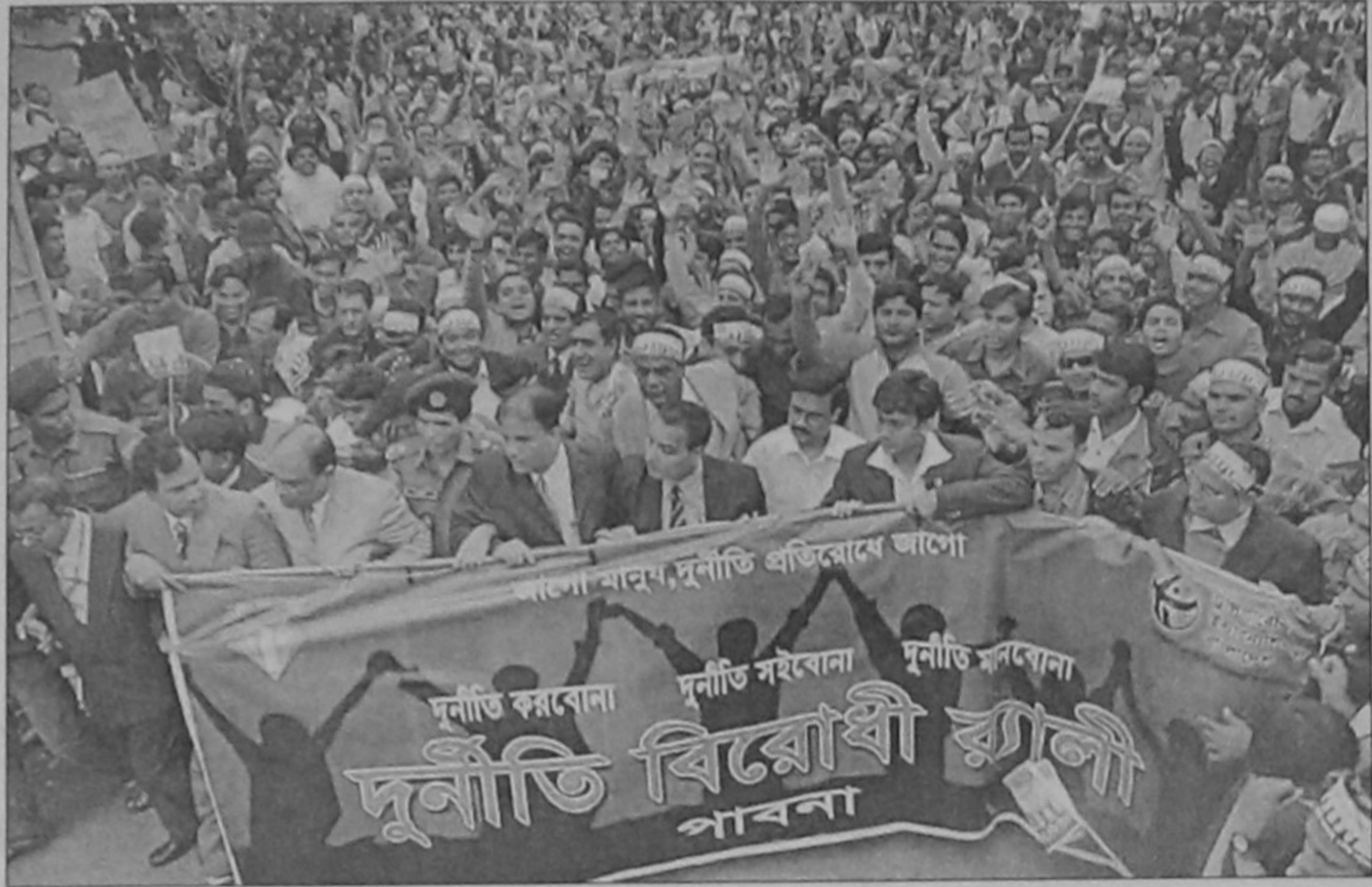
Partial view of a huge rally against corruption in Pabna yesterday.