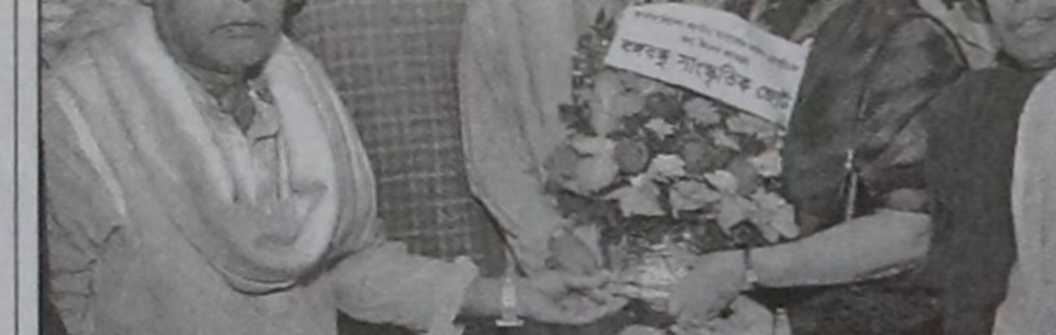
Leaders and activists of different political and socio-cultural organisations greet National Professor Kabir Chowdhury with bouquets on the occasion of his birthday at his residence at Naya Paltan in the city yesterday.