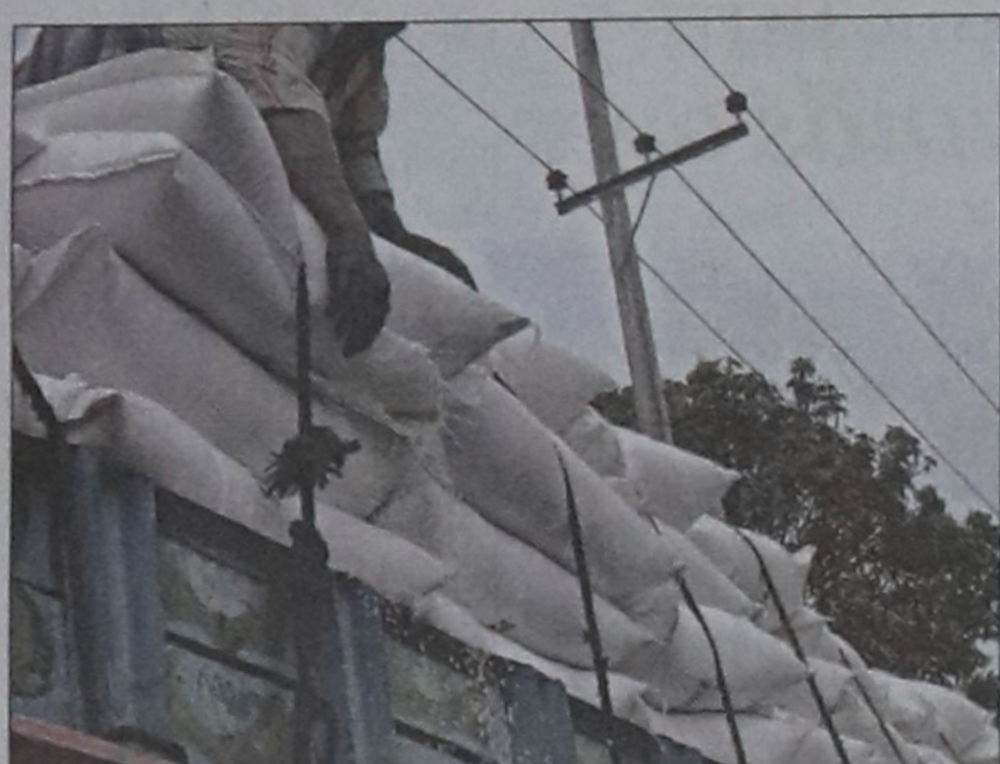
INNOVATIVE PINCH... A gang slits sacks of rice on a truck, left, as it was leaving Chittagong Port yesterday. Some of the gang members are seen collecting rice that fell on the street.