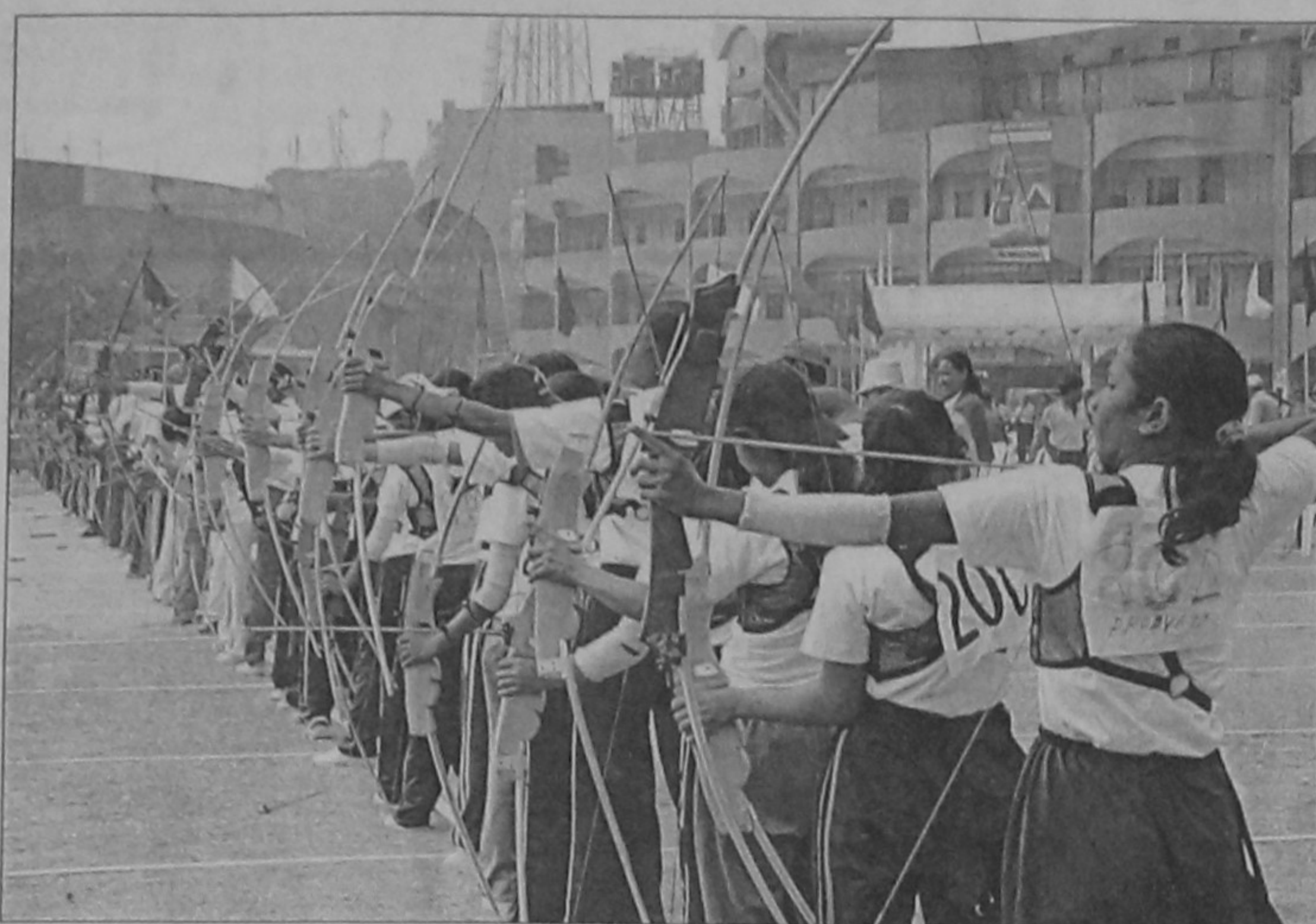
Archers prepare to sling arrows on the opening day of the 3rd National Archery Championship at the Outer Stadium yesterday.

"Now Fabio Capello knows why he's earning six million pounds ($11.78 million) a year" said another headline, with a report suggesting there were periods of the game that looked worryingly like the 3-2 defeat by Croatia that ended Steve McClaren's reign as coach.