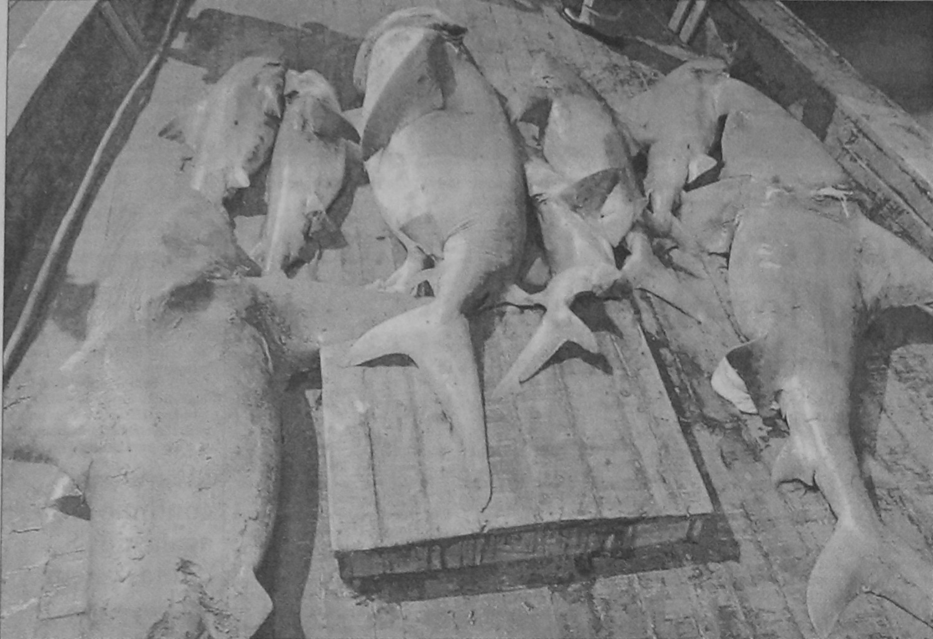
The eight dead sharks on a trawler at Dublarchar in the Sundarbans after their recovery from inside four trawlers on Tuesday.

Legal action will be taken against fishermen under the Forest Act for catching sharks, the DFO said.