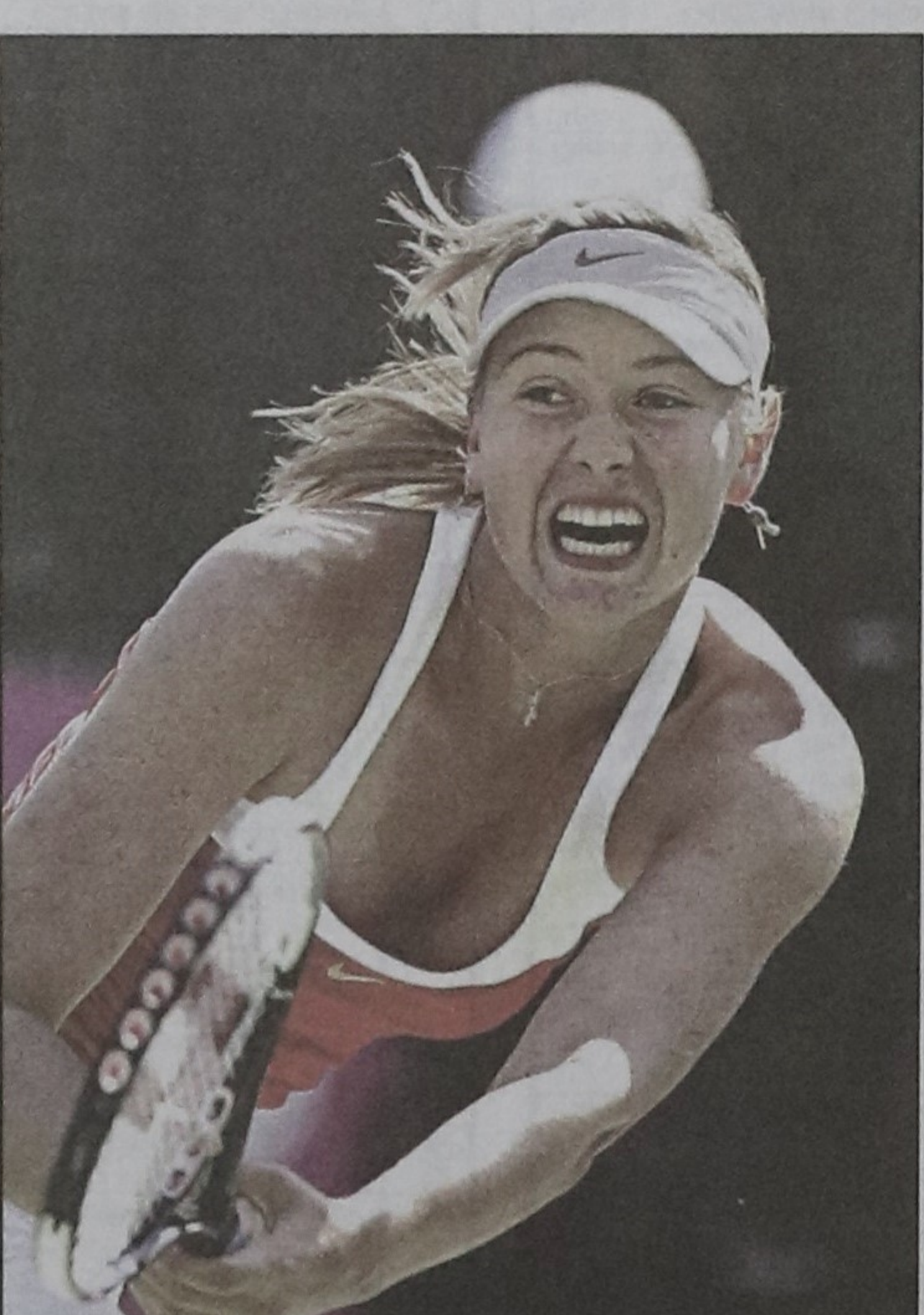
Russia's Maria Sharapova makes a backhand return against Israel's Shahar Peer during their Fed Cup match in Tel Aviv on Sunday.