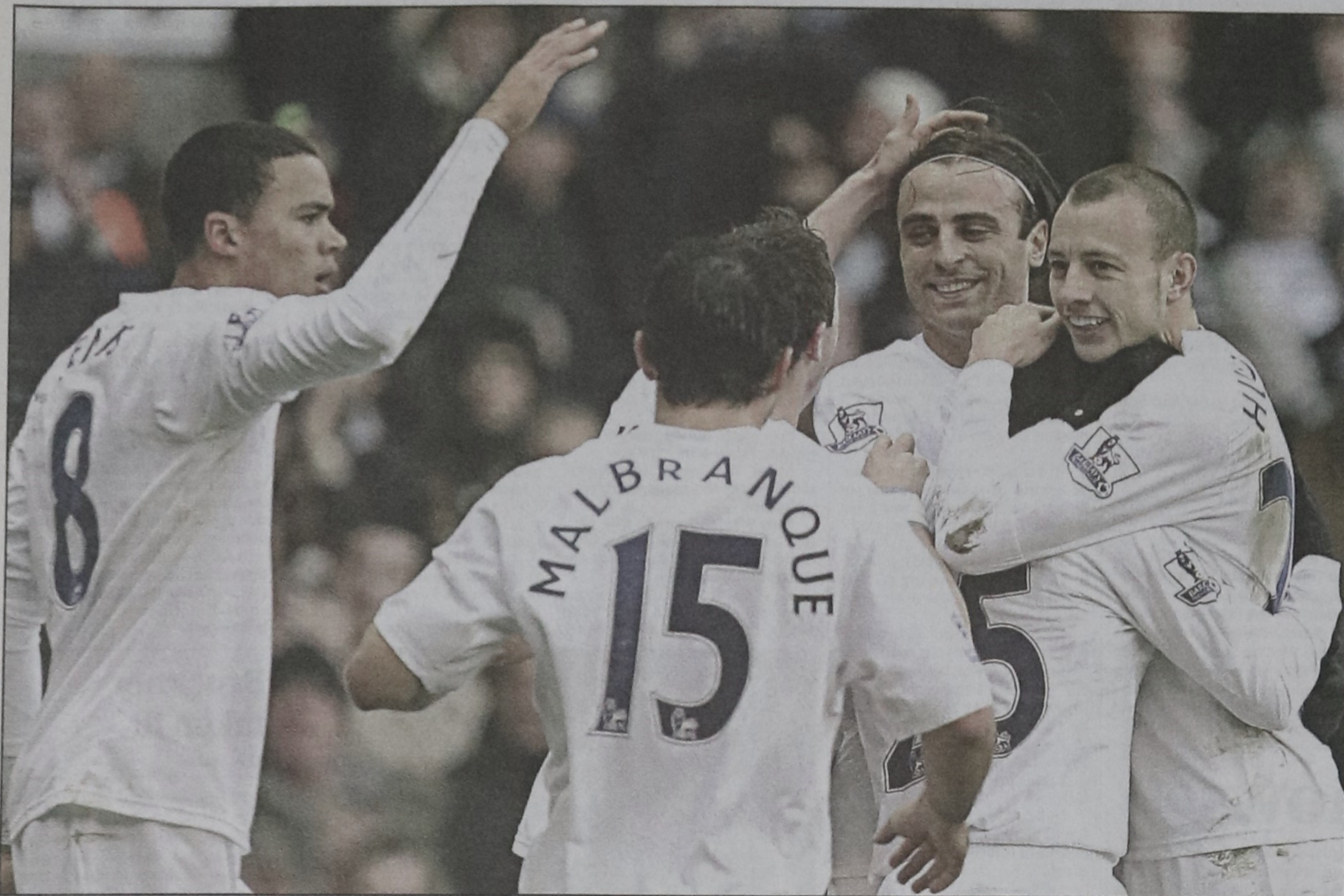
Tottenham striker Dimitar Berbatov (2nd from R) is congratulated by teammates after scoring against Manchester United in their Premiership match at White Hart Lane on Saturday.