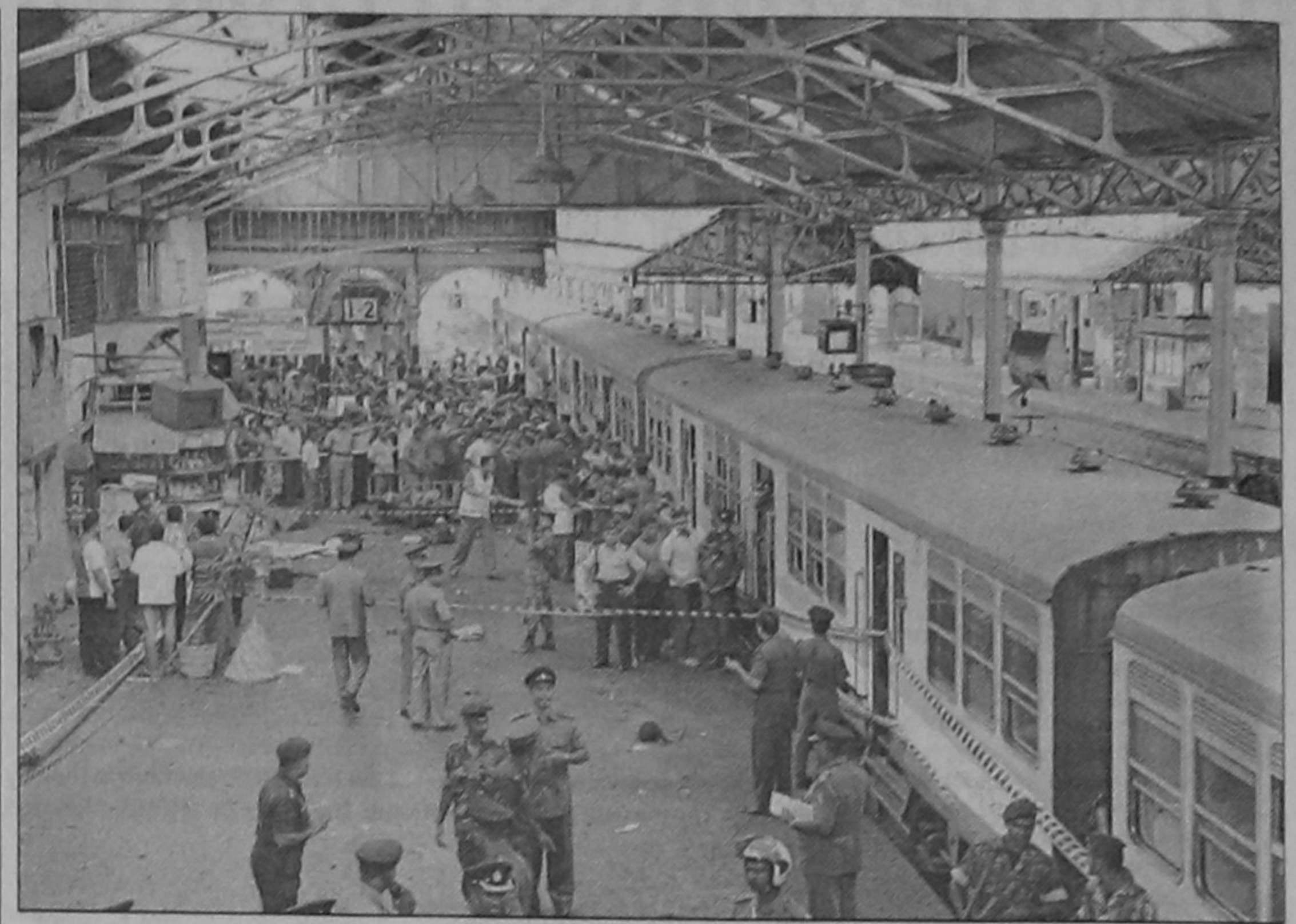
Sri Lankan military personnel conduct investigations at the main railway station in Colombo yesterday, following a suicide attack. A suicide bomb ripped through a train in Sri Lanka's capital Colombo, killing at least 10 people and injuring nearly 100 on the eve of independence day celebrations.

The incident highlights the factionalism and rivalry that runs rampant in Afghanistan, where local strongmen have their own private security forces, and is a cause of instability, along with the bloody Taliban-led insurgency.