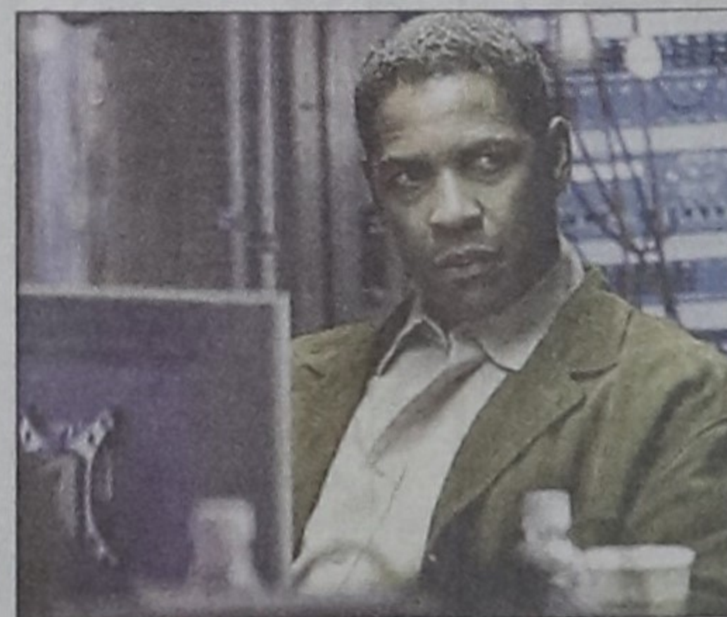
Deja Vu On Star Movies at 7:00 pm Genre: Action Cast: Denzel Washington, Paula Patton

All programmes are in local time. The Daily Star will not be responsible for any change in the programme.