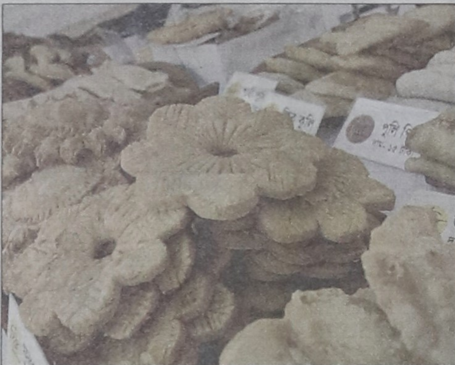
Delicious pithas offered at the festival

Winner of the "Mojo Cowboy Offer" contest was given a cow in the evening. The festival continued till 9 pm.