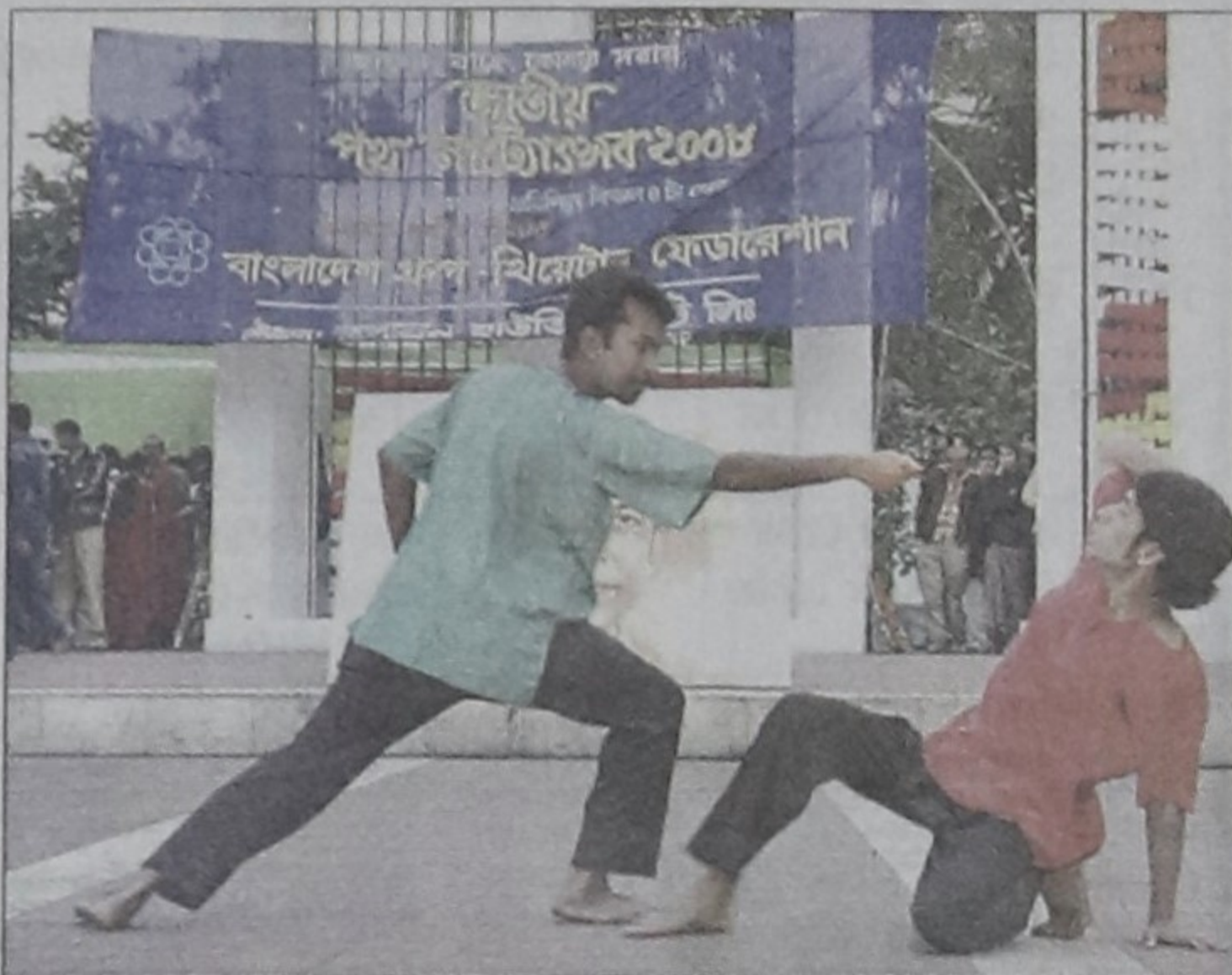
A scene from one of the plays staged at the festival

On the opening day Anushilan Natya Dal from Rajshahi, Chhattagram Theatre from Chittagong, Swattik Natya Sampradaya (Dhaka) Purobi Sanskritik Chakra (Dhaka) and Natyafauz (Dhaka) staged Shunagoriker Shandhyane, 1971, Pataka O Nirob Shokun, Apriyo Satya and E Kon Jati respectively. Most of these plays feature the heinous activities done by the Pakistani collaborators during the Liberation War of Bangladesh. While some of the plays focus on the necessity of the trial of the Pakistani collaborators.