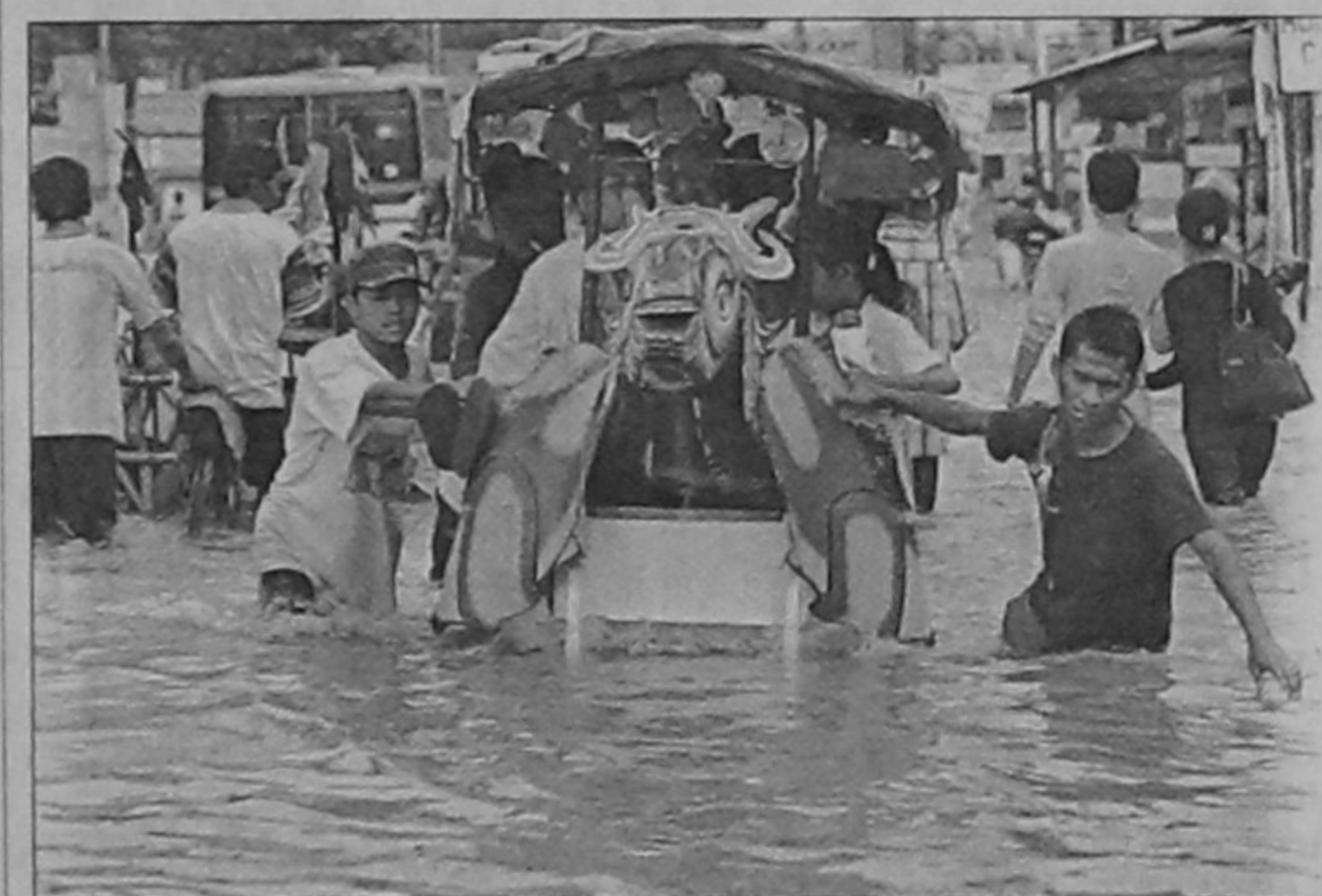
Residents ride three wheeled vehicles as they pass through flooded streets in Tangerang yesterday. Heavy flooding in Indonesia's capital has killed three people and forced nearly 1,500 to evacuate their homes.