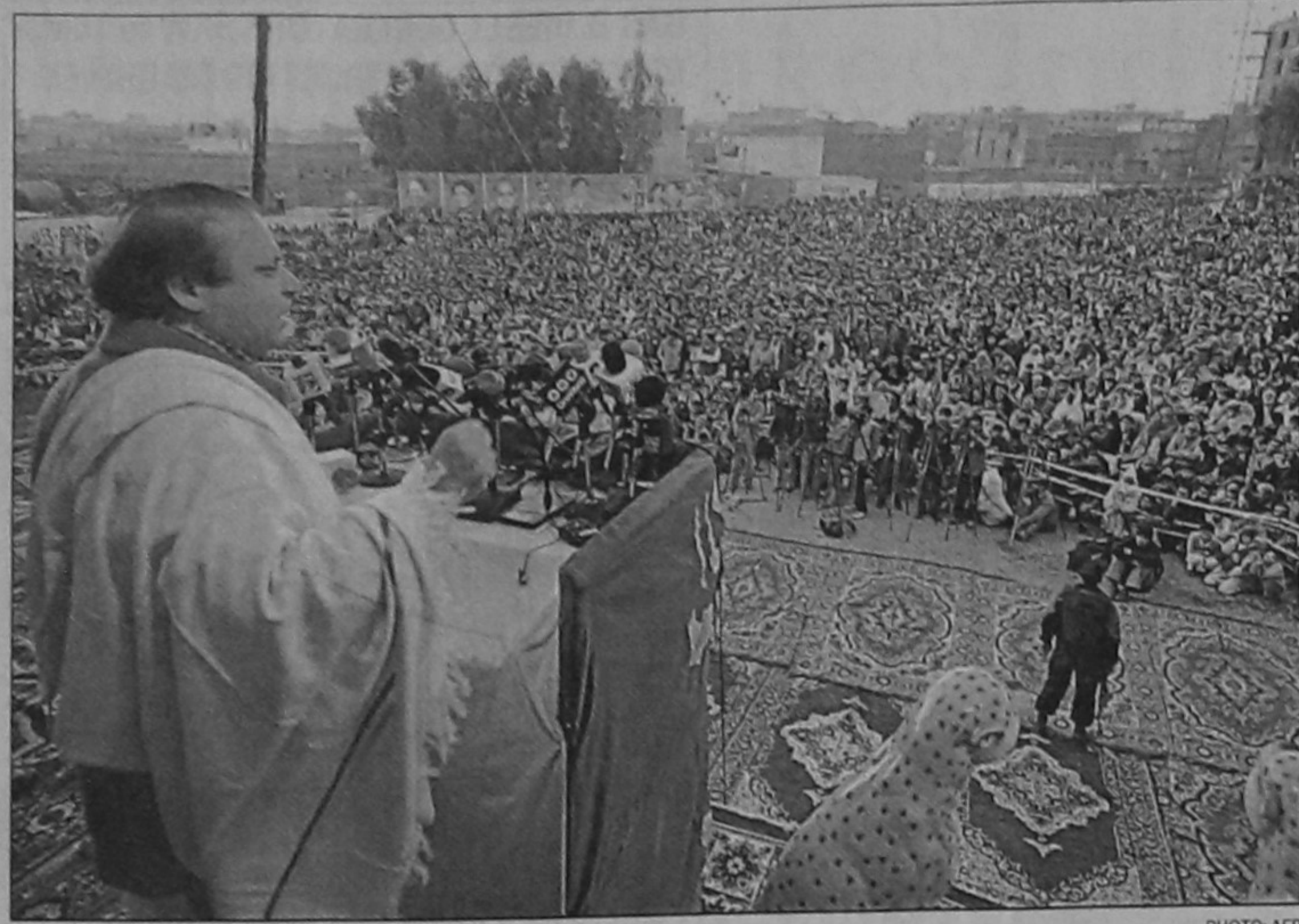
Former Pakistani prime minister Nawaz Sharif is addressing a public rally in Textla, some 25km from Islamabad Friday as part of the campaign for Feb 18 election.