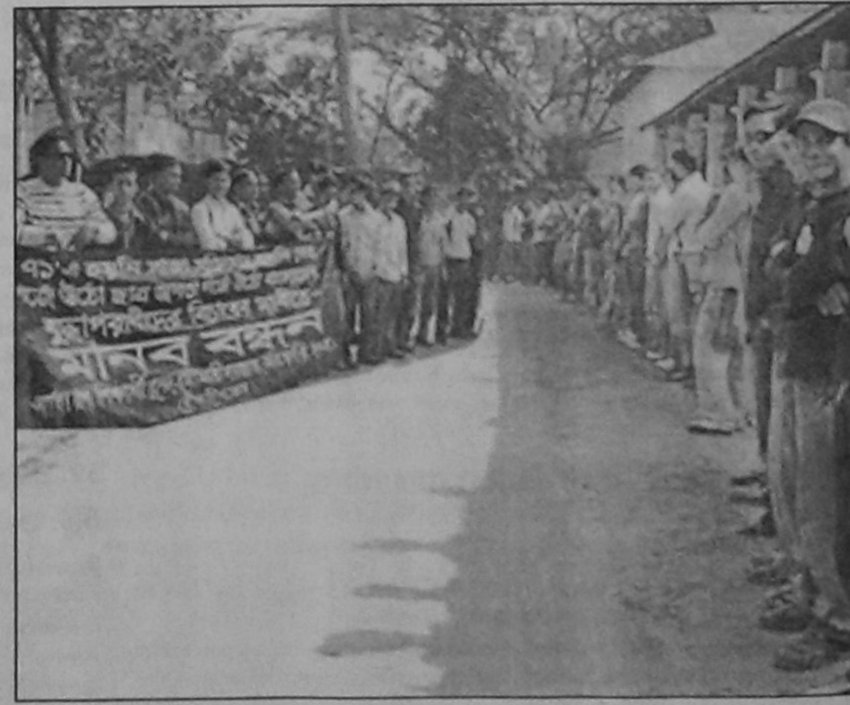
From left, sector commanders of Liberation War at divisional freedom fighters' convention in Barisal, and human chains at Gouranga Bazar in Kishoreganj and Moulvibazar Government College demanding trial of war criminals.