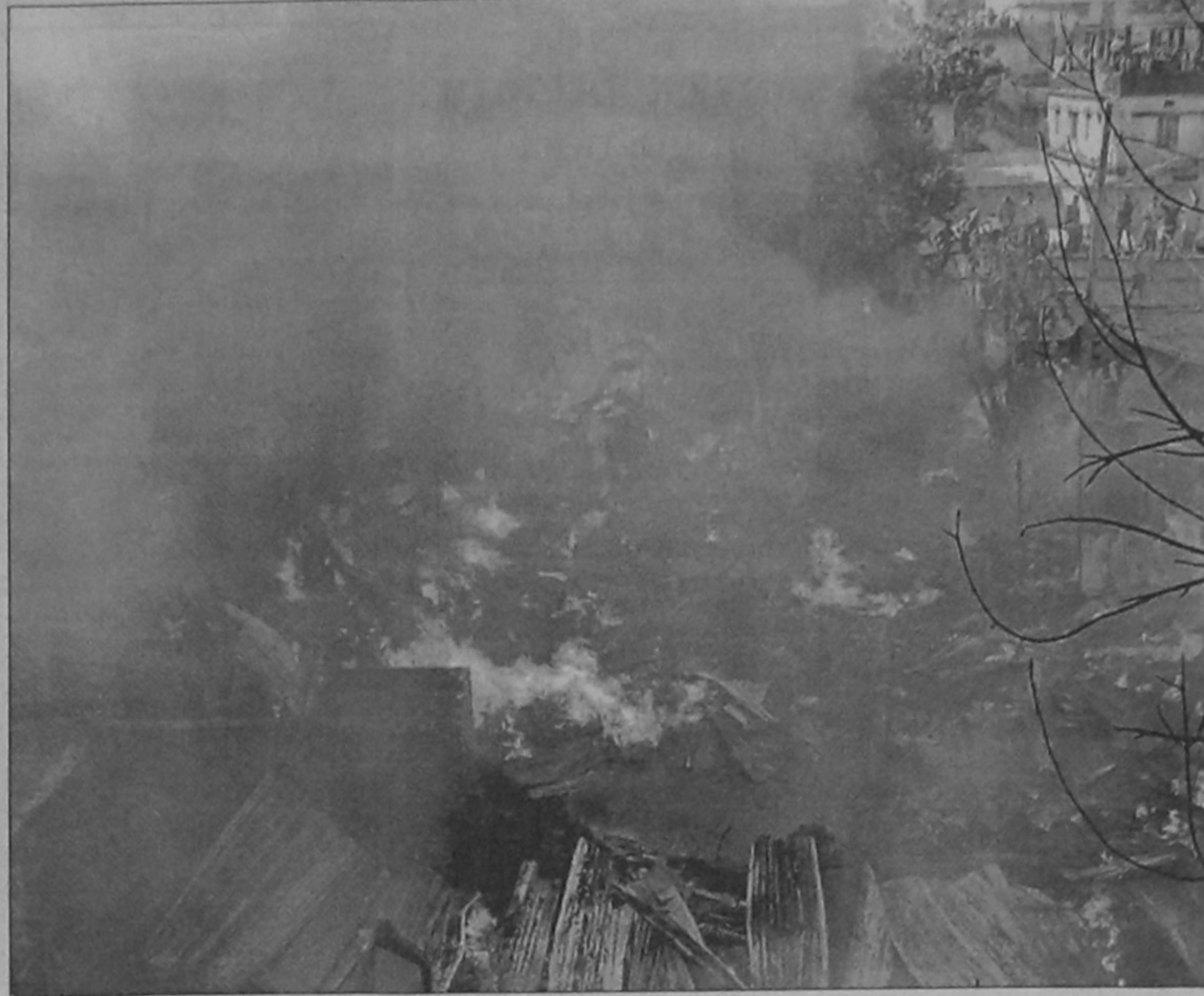
Eighteen shanties and three shops were gutted in a fire that broke out at Satkania colony at Lalkhan Bazar in Chittagong yesterday.

The loss in the fire was estimated at Tk 3.50 lakh, said the fire service sources.