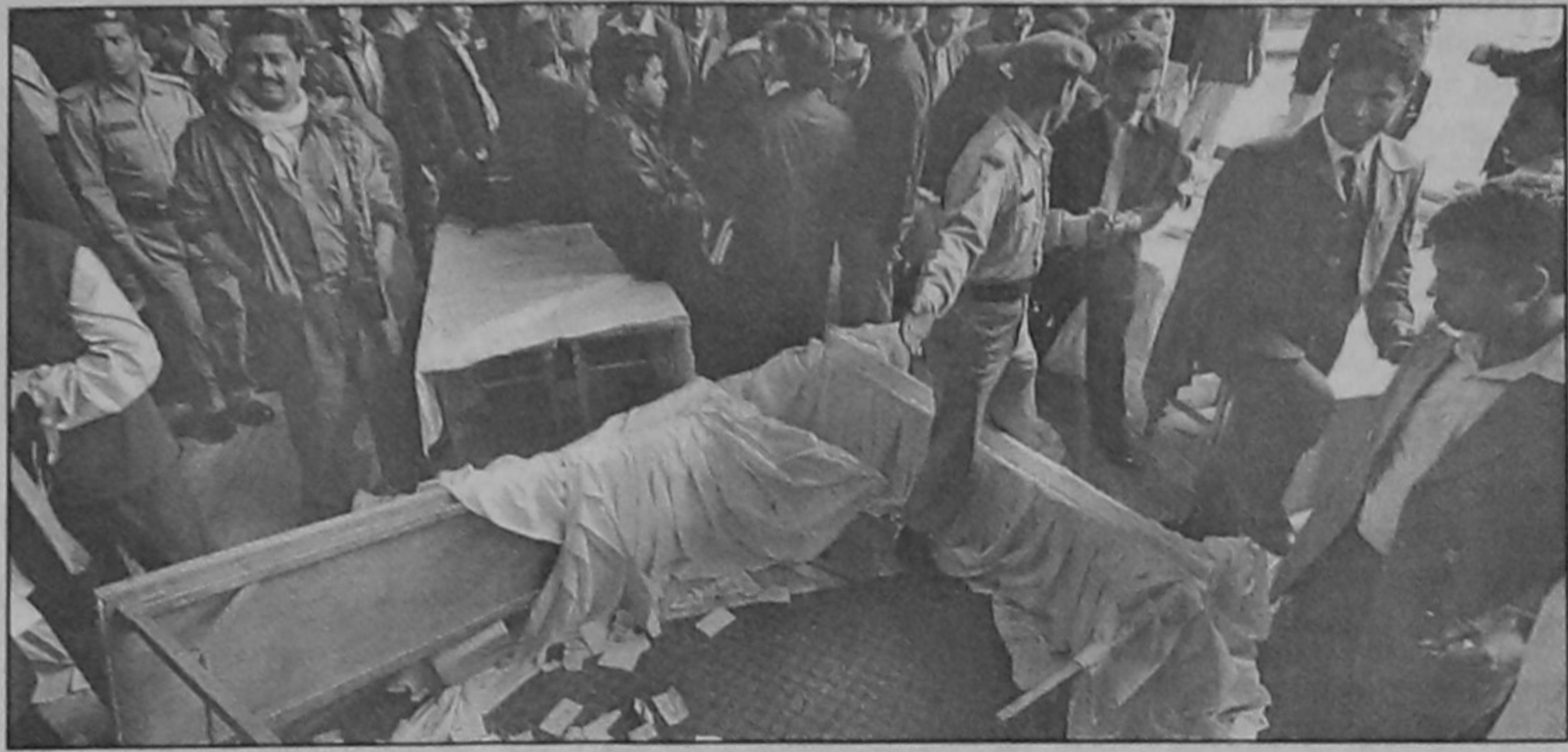
Enraged shareholders go berserk at the UCBL's annual general meeting at Sonargaon hotel in Dhaka over dividend dispute yesterday.