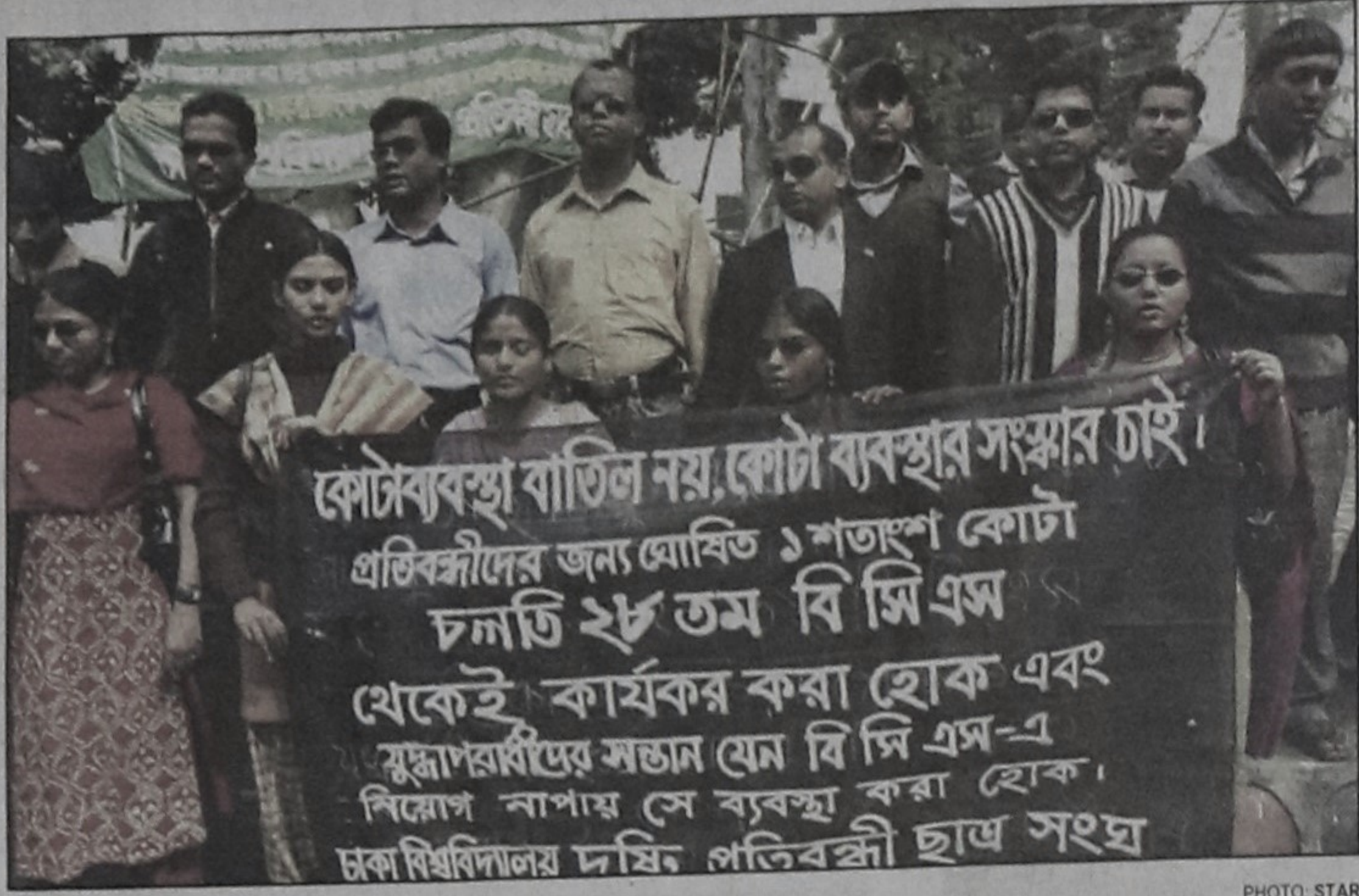
Visually challenged students of Dhaka University stage a demonstration in front of the Aparajeyo Bangla on the campus yesterday demanding review of the quota system in the BCS examinations.