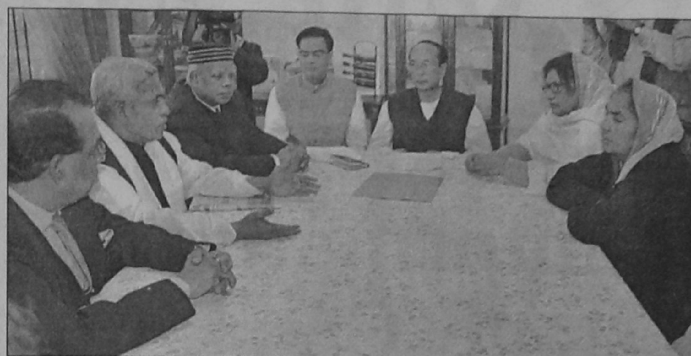
Awami League presidium members hold a meeting at the residence of AL Acting President Zillur Rahman in the city yesterday.

Delegates of the developing countries said that they would work it out during the inter-session period and finalise it in Doha in 2009.