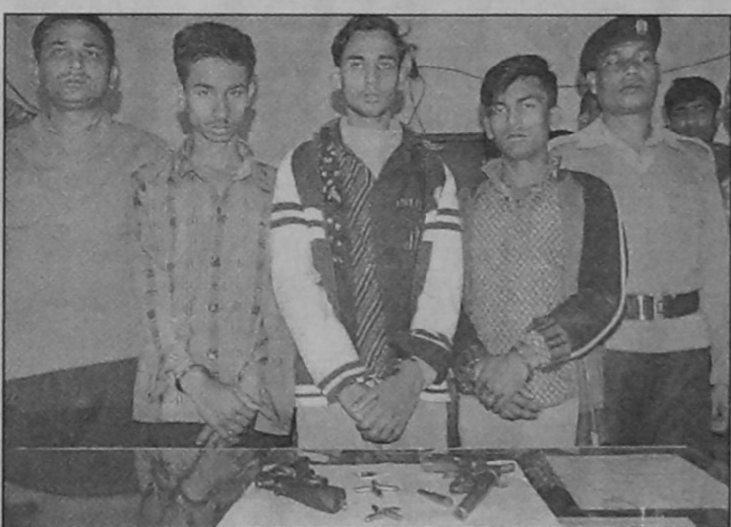
Police arrested three youths with two firearms and nine rounds to bullets at Pallabi in the city yesterday.

"The poultry industry has the potentials to steer Bangladesh towards rapid economic progress like the garment and shrimp industries. Now this booming sector is facing a severe threat following the attack by avian influenza. The government should take all-out efforts to tackle the threat effectively," he said.