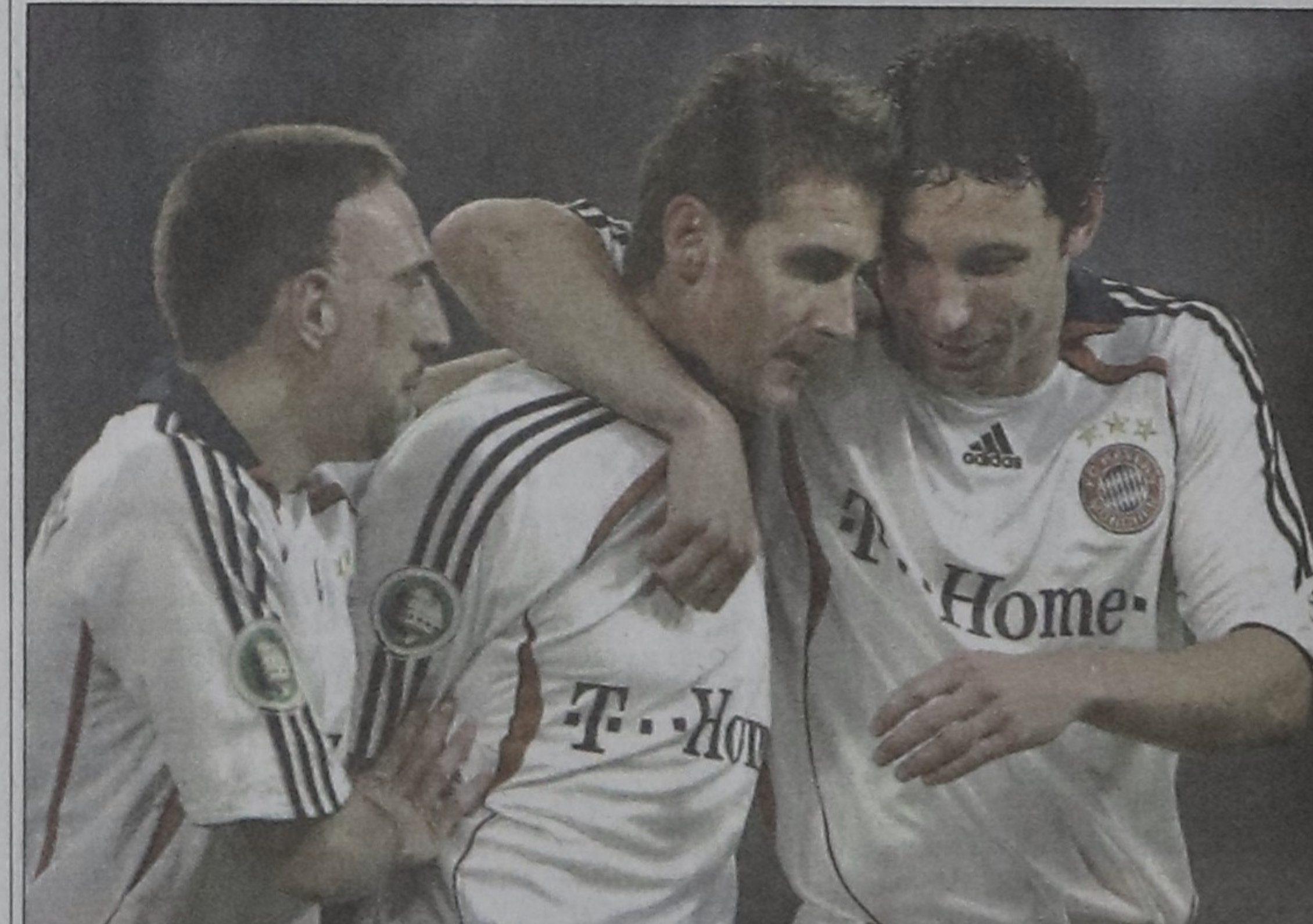
Bayern Munich striker Miroslav Klose (C) is congratulated by midfielders Mark van Bommel (R) and Franck Ribery during their German Cup match against Wuppertal at the Veltins Arena in Schalke on Tuesday.

Second division strugglers Carl Zeiss Jena take on first division Arminia while Hamburg are at third division Rot-Weiss Essen.