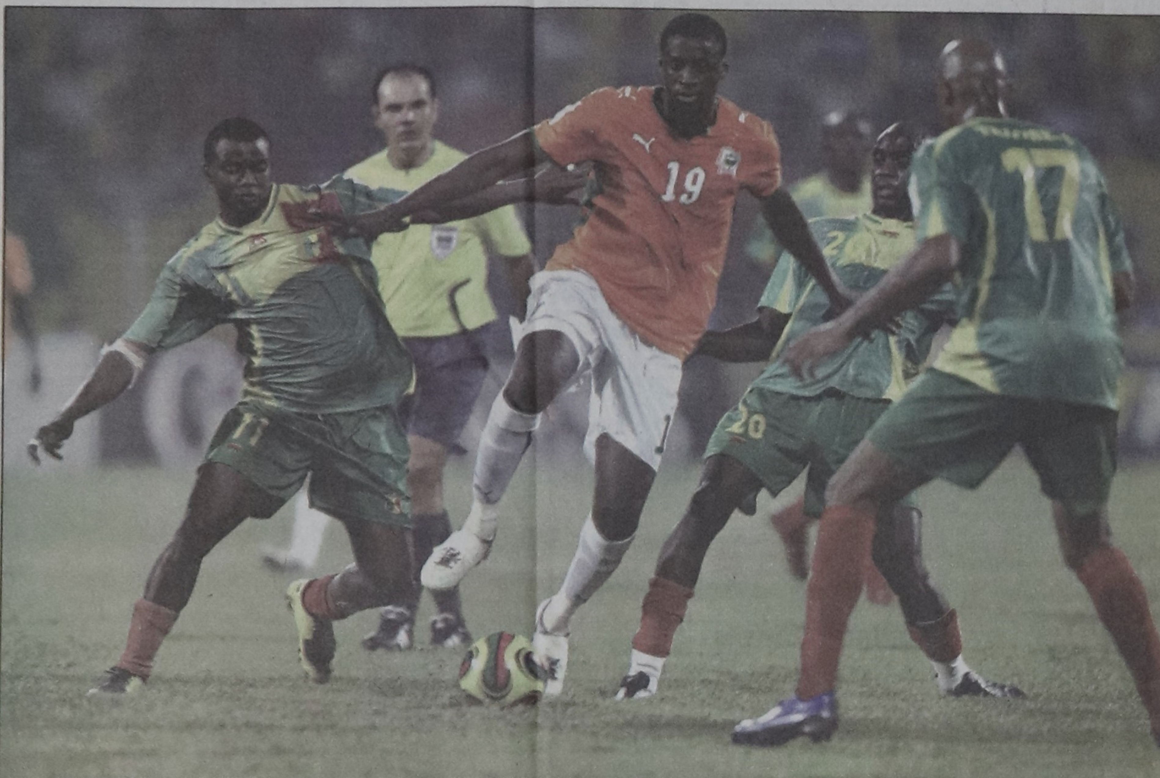
Ivory Coast hardman Yaya Toure (C) battles Mali players during their African Nations Cup match in Accra on Tuesday.