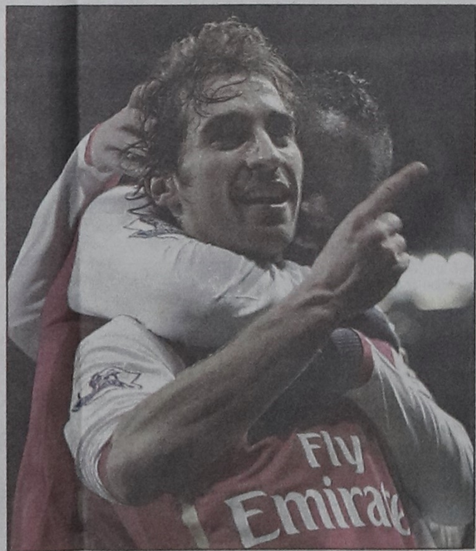
Arsenal midfielder Mathieu Flamini (front) is hugged by captain William Gallas after his cracking goal during their Premiership match against Newcastle at the Emirates Stadium in London on Tuesday.