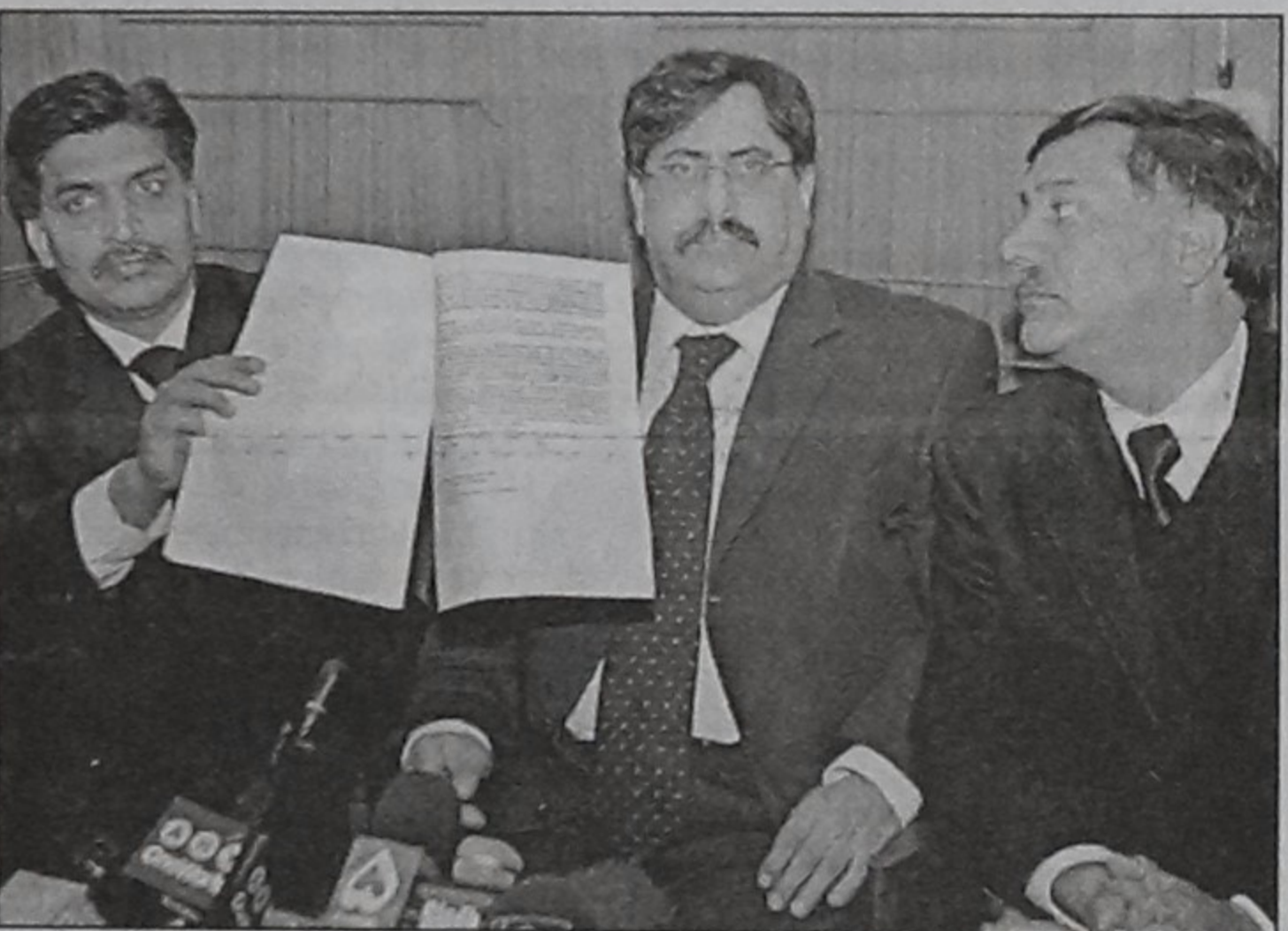
A senior Pakistan Supreme Court lawyer shows a copy of a letter written by deposed chief justice Iftikhar Muhammad Chaudhry at a press conference in Islamabad yesterday. Pakistan's deposed chief justice attacked President Pervez Musharraf in a smuggled statement as an "extremist general" for keeping him and his family under detention