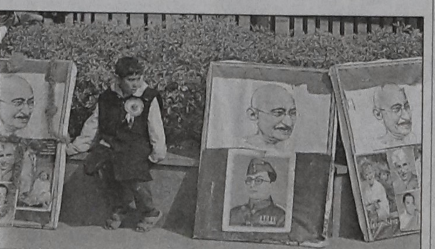
An Indian boy sits next to portraits of 'father of the nation' Mahatma Gandhi, outside Rajghat after a function to mark his sixtieth death anniversary in New Delhi yesterday. Gandhi was shot dead by a Hindu hardliner on January 30, 1948 at a prayer meeting in New Delhi.

Unrest in the wake of Bhutto's killing and an ongoing wave of Islamic militancy have deepened the sense of crisis in the nuclear-armed nation of 160 million people.