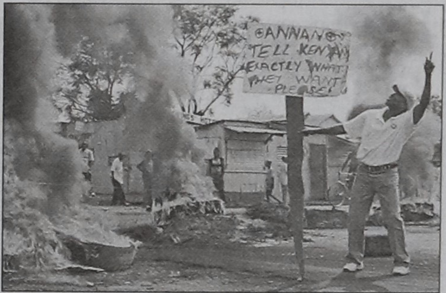
A supporter of Kenya's opposition leader Odinga Raila shows a sign near a burning tyre barricade in the Western Kenyan town of Kisumu on Tuesday.

There are four categories of people who will face tough police action: Those looting property, burning houses, carrying offensive weapons, barricading roads, the police commander told AFP, a day after military helicopters fired above ethnic fighting in the lakeside town of Naivasha, the latest flashpoint.