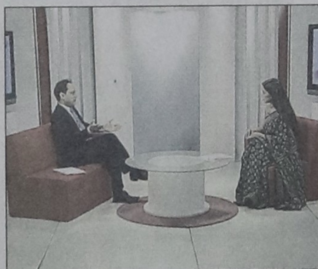
Tini On ETV at 7:30 pm Guest: Anwar Chowdhury, British High Commissioner