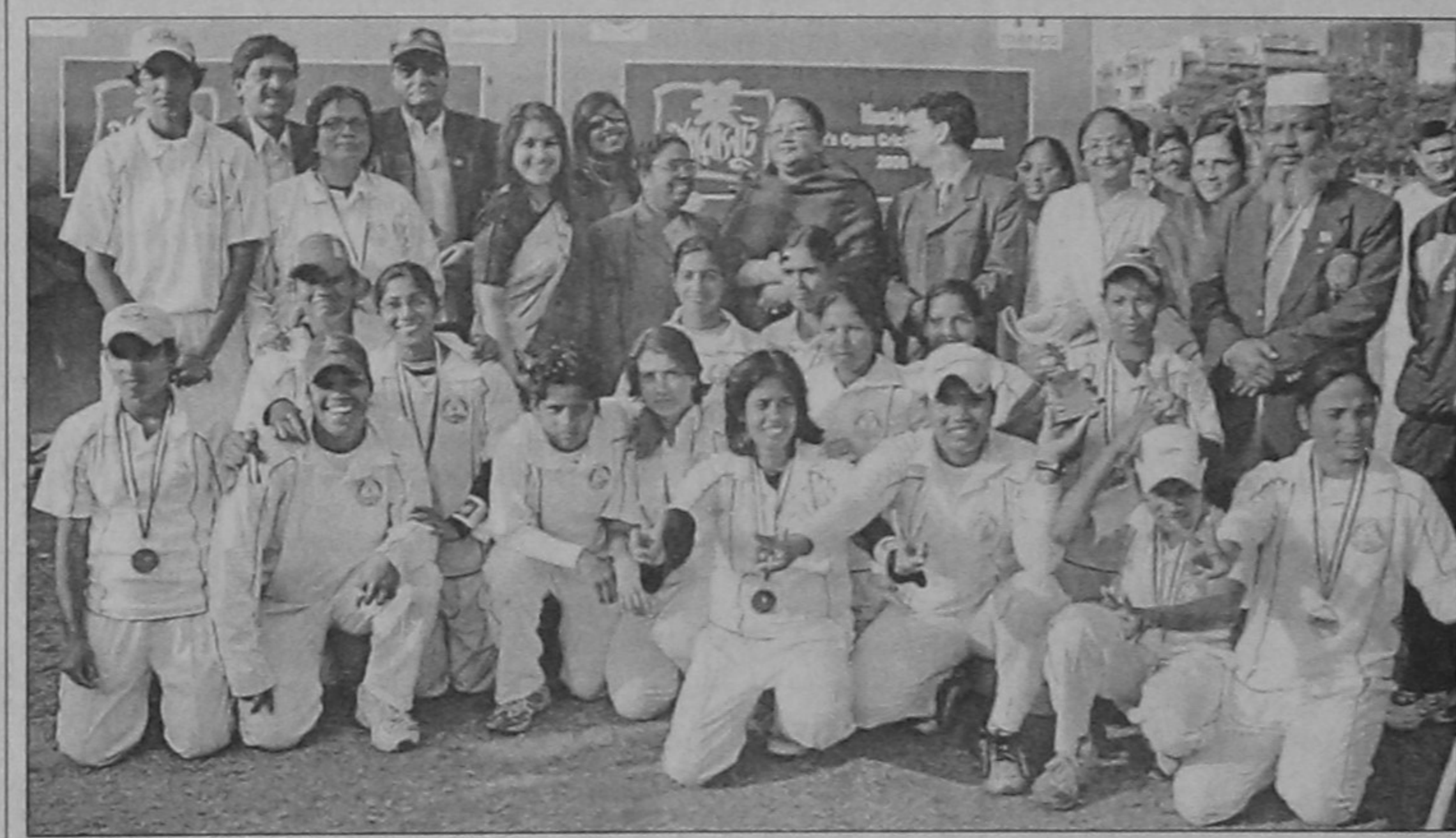
Ansar and VDP players celebrate with the trophy after beating Ispahani Sporting Club in the final of the Parachute Women's Open cricket tournament at the Dhanmondi Cricket Stadium yesterday.