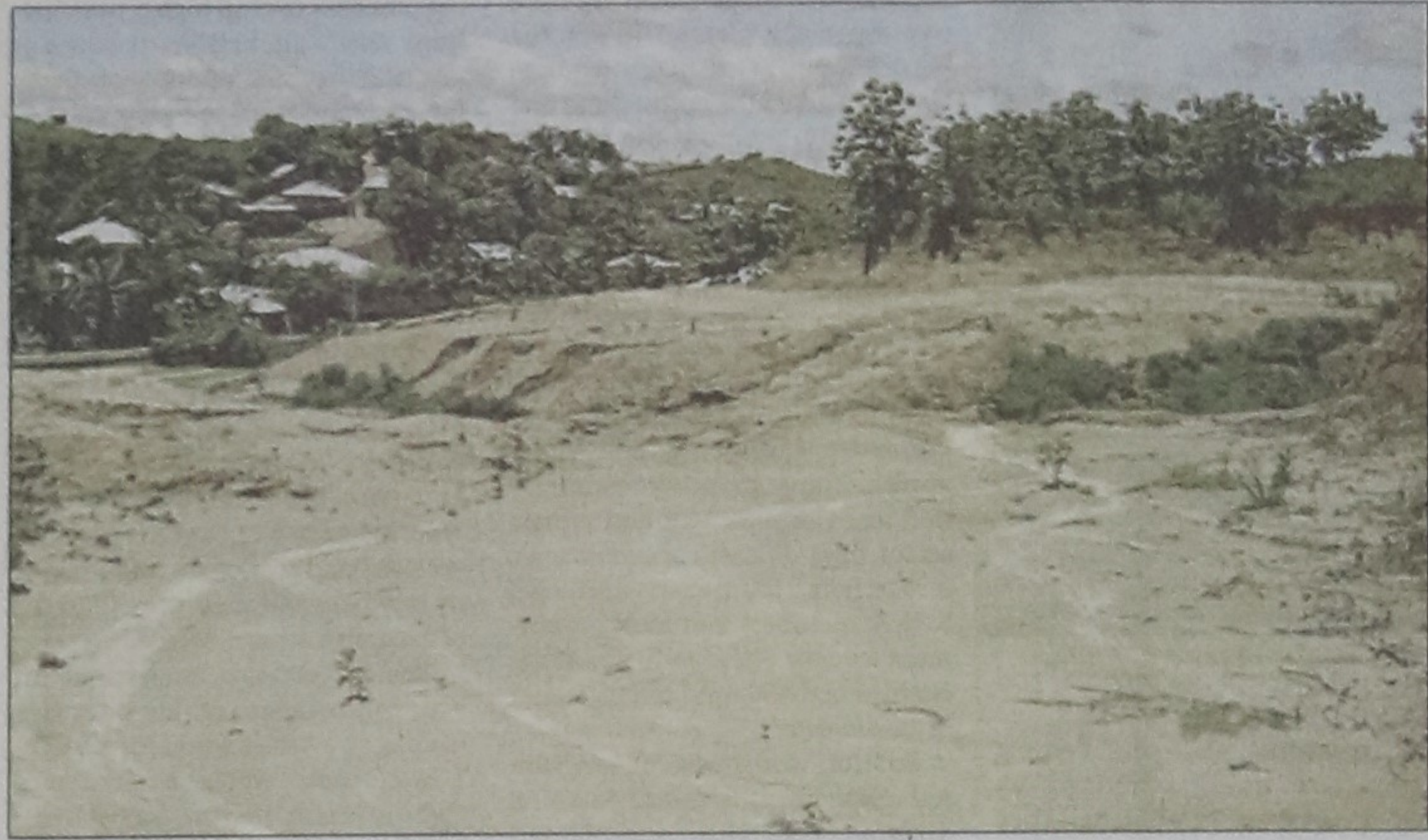
Site of a razed hill in Khagrachhari Sadar upazila.

Bangladesh Environment Lawyers Association (BELA) in 2006 issued legal notices on some government officials and those engaged in hill cutting in eight upazila of the district, but to no effect.