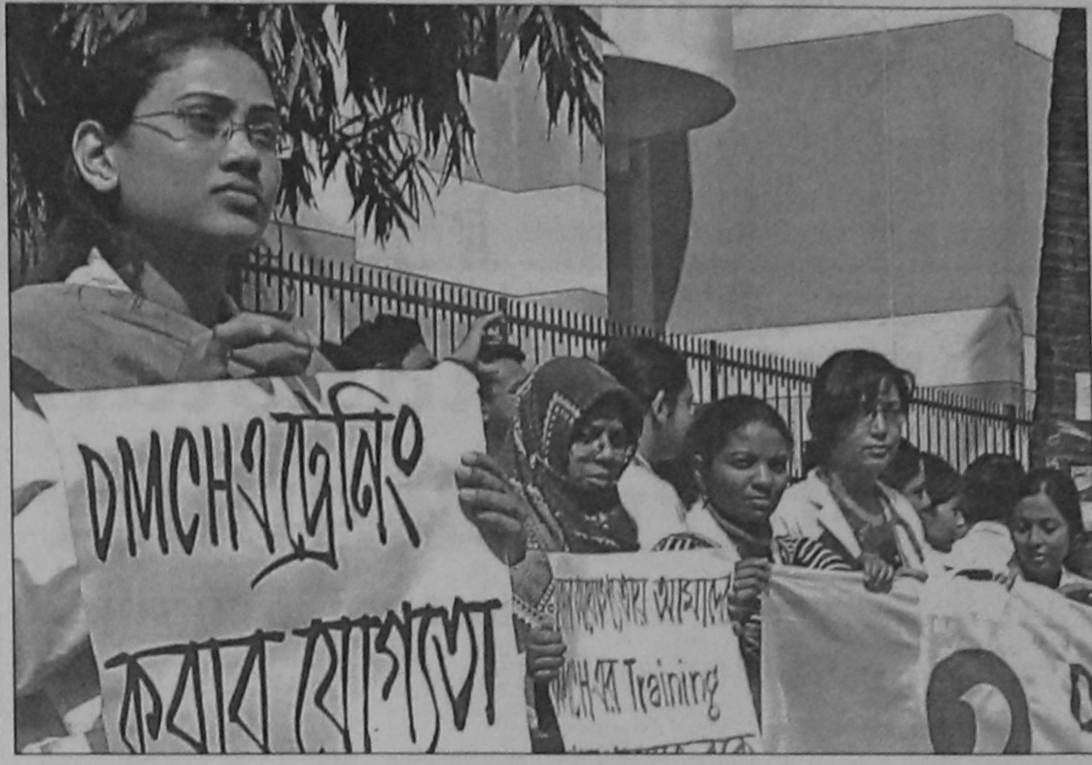
Dhaka Medical College students form a human chain demanding honorary training facilities for the fresh graduates on the college premises in the city yesterday.

national ineffectiveness." He said in its (HBFC) place, domestic and international commercial banks and a few new specialised institutions have entered the market with a significant potential growth.