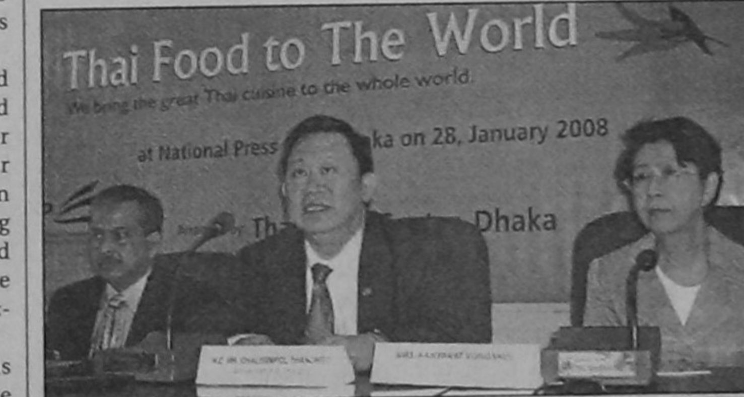
Thai Ambassador to Bangladesh Chalermphol Thanchitt speaks at a press conference titled 'Thai food to the world' at the National Press Club in the city yesterday.

FROM PAGE 16 The bidding will offer attractive gas price prospects, but it also withdraws zero corporate tax facilities for oil companies--a benefit that was offered in the previous block bids.